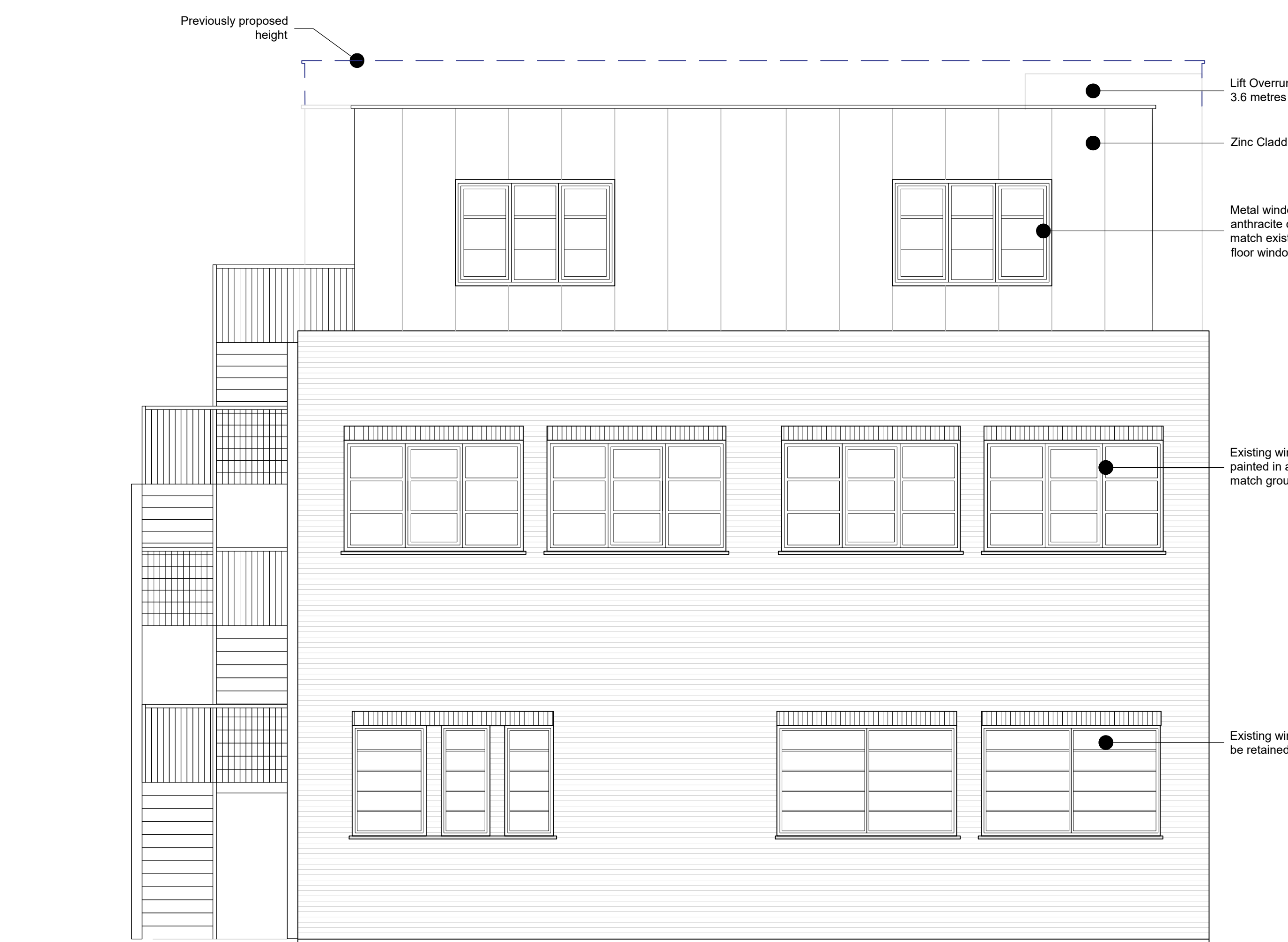
PROPOSED SIDE ELEVATION (left)