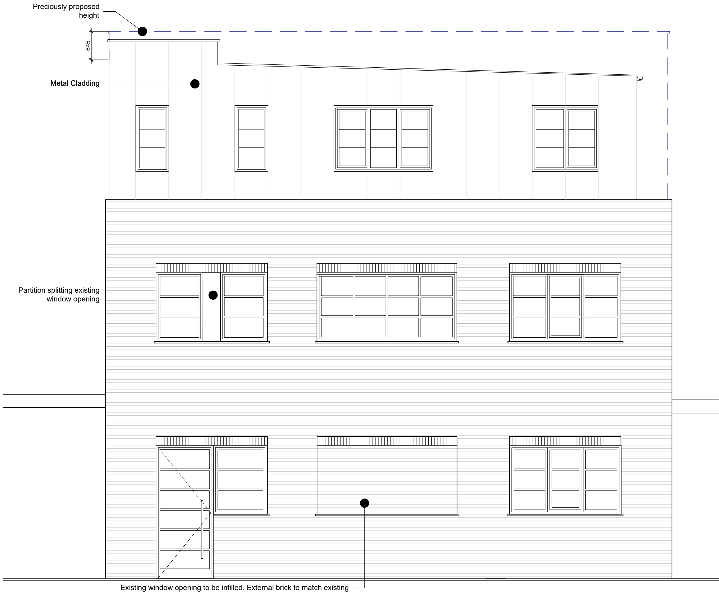
PROPOSED SIDE ELEVATION (right)