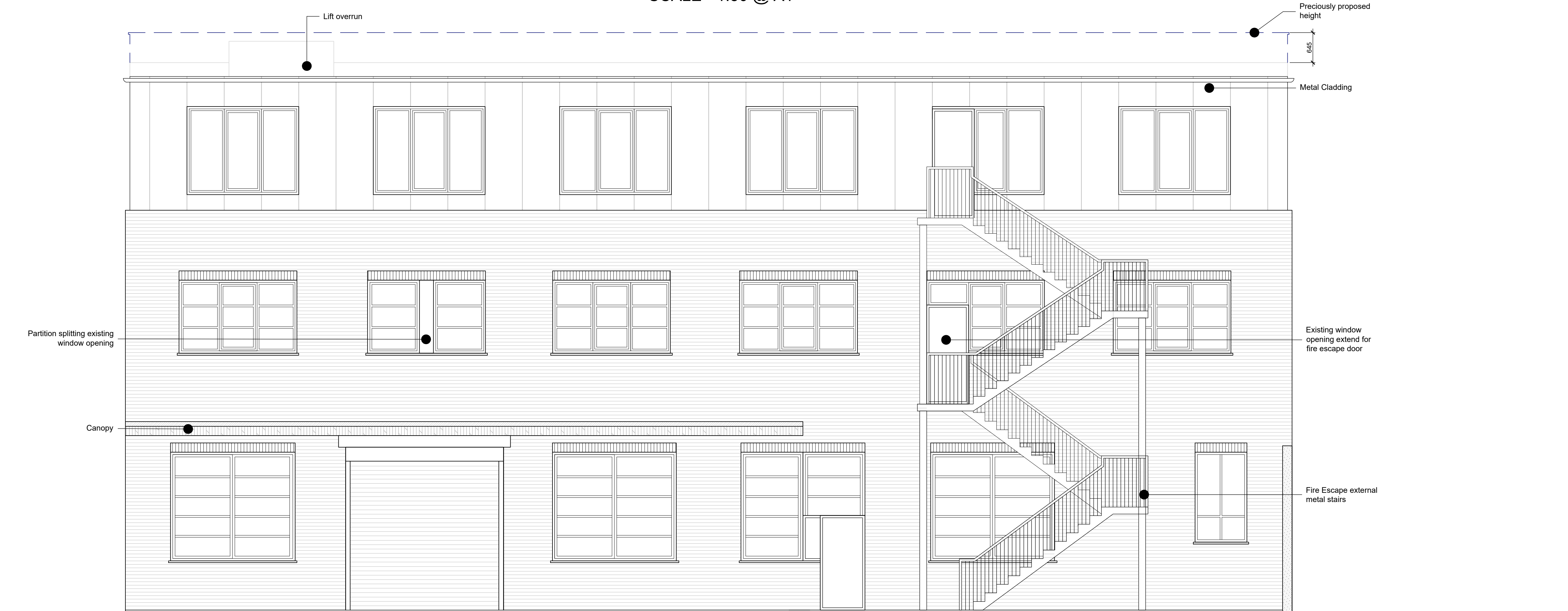
PROPOSED REAR ELEVATION SCALE - 1:50 @ A1