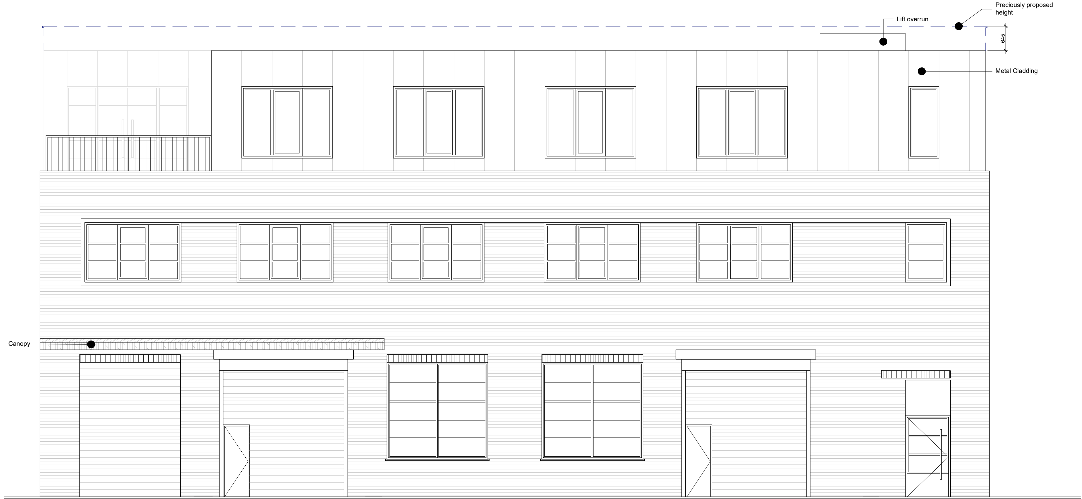
PROPOSED FRONT ELEVATION SCALE - 1:50 @ A1