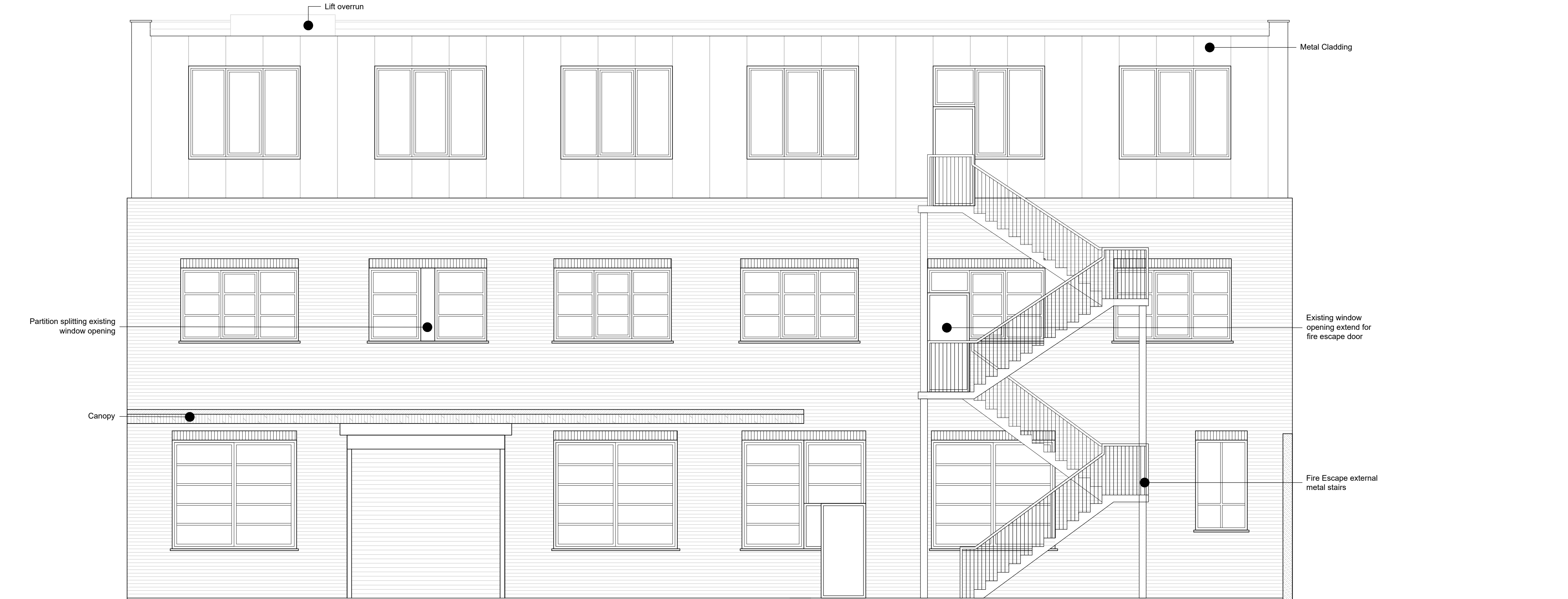
PROPOSED REAR ELEVATION SCALE - 1:50 @ A1