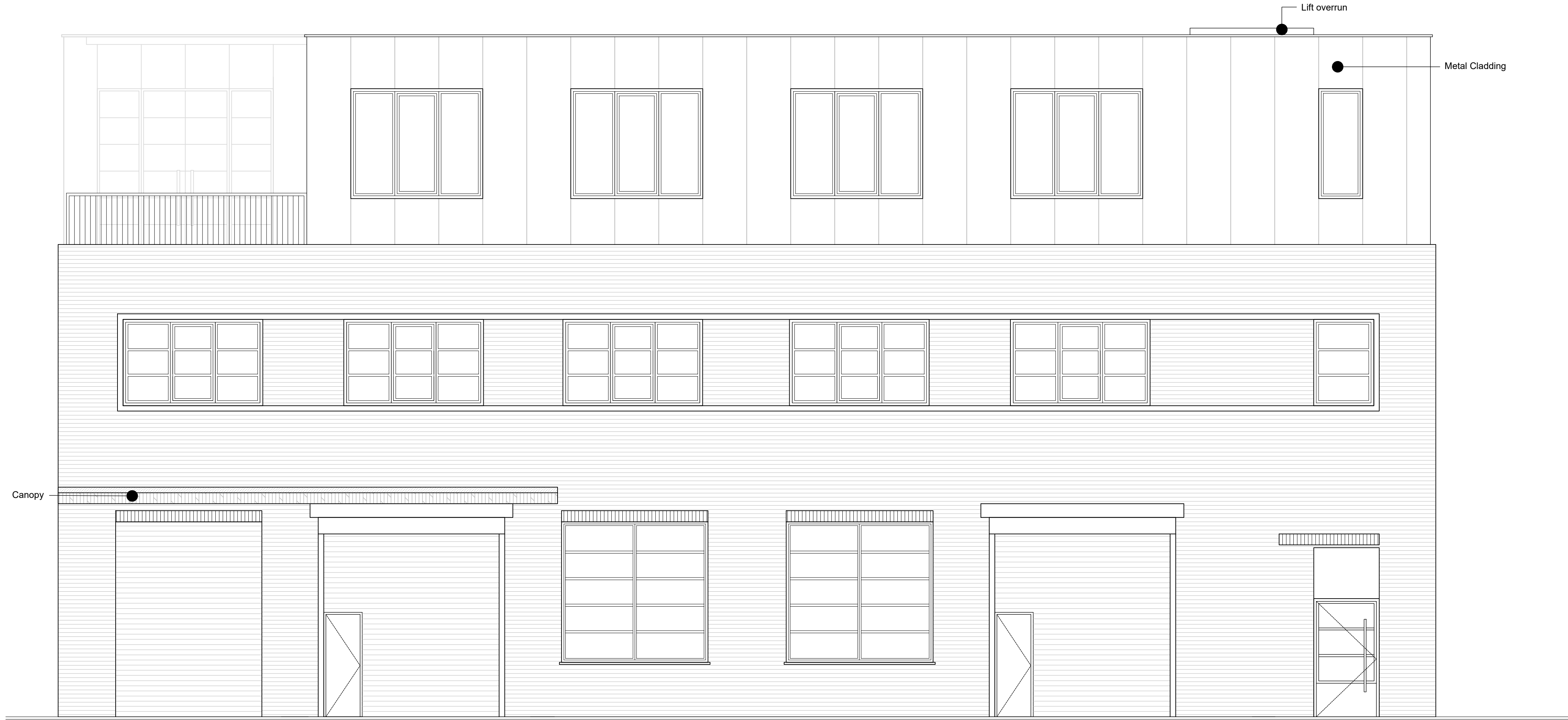
PROPOSED FRONT ELEVATION SCALE - 1:50 @ A1