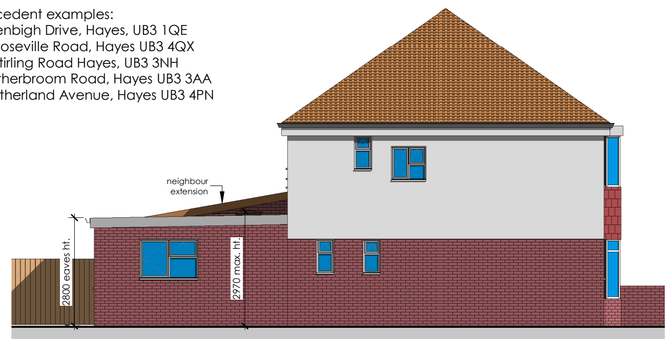
5 Side Elevation (Proposed) 2312-A-301 1 : 100

Precedent examples: 2 Denbigh Drive, Hayes, UB3 1QE 20 Roseville Road, Hayes UB3 4QX 39 Stirling Road Hayes, UB3 3NH 4 Hitherbroom Road, Hayes UB3 3AA 1 Sutherland Avenue, Hayes UB3 4PN