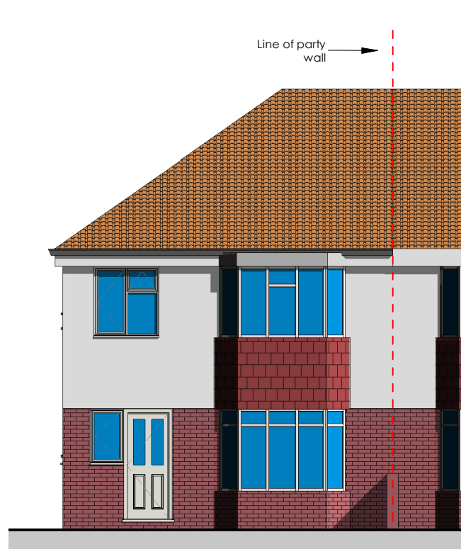
3 Front Elevation (Proposed) 2312-A-301 1 : 100