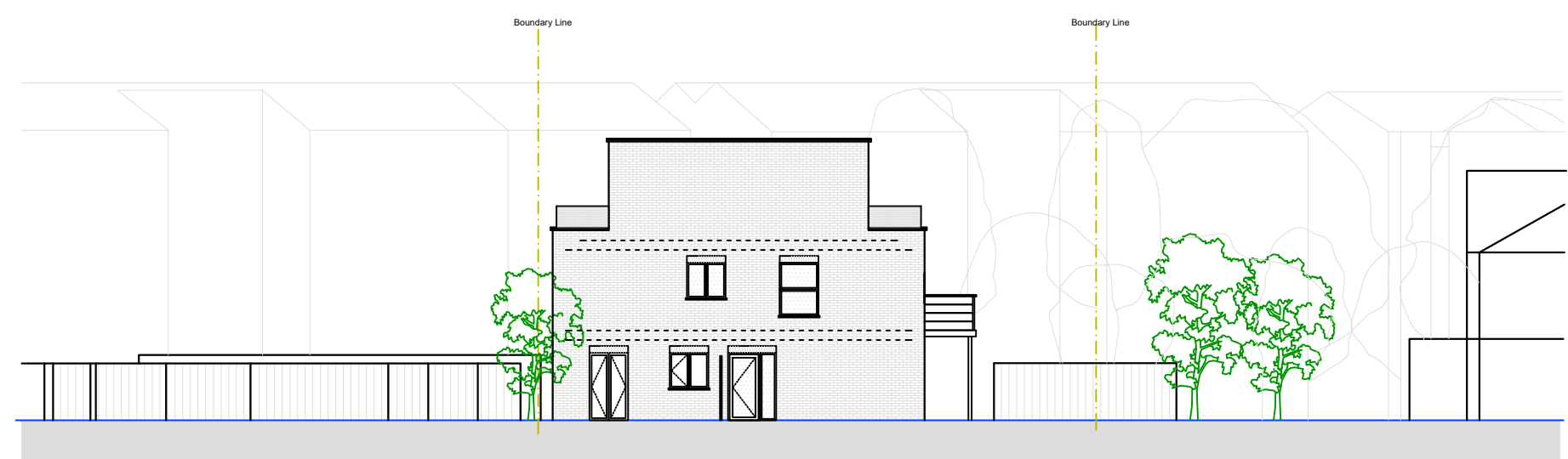
○ Side Elevation 1 1 : 2 0 0