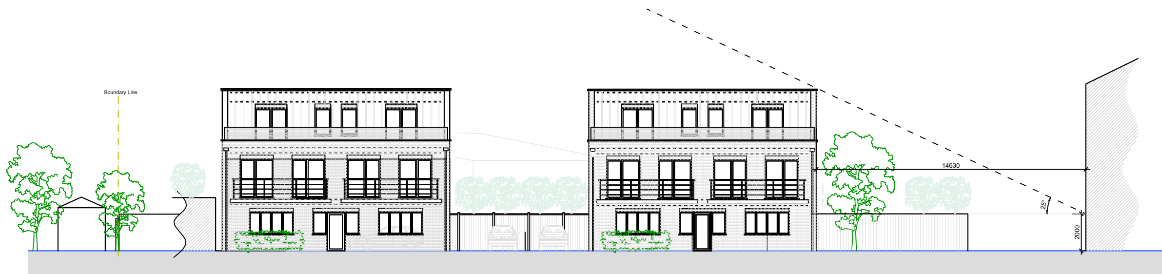
○ Front Elevation 1 : 2 0 0