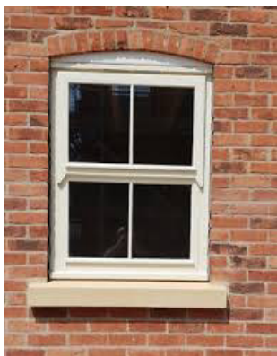
D) Typical Bath stone cill