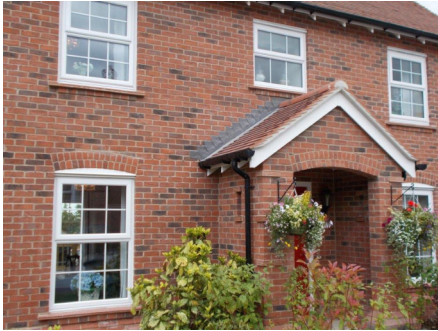
A) Windows and doors: Plain white UPVC