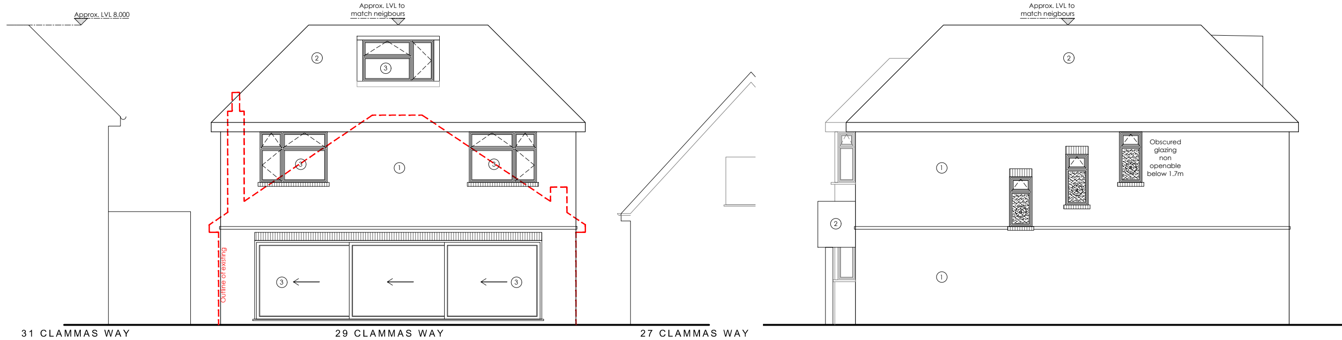
PROPOSED REAR ELEVATION - Scale 1:100