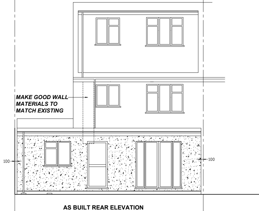
AS BUILT REAR ELEVATION