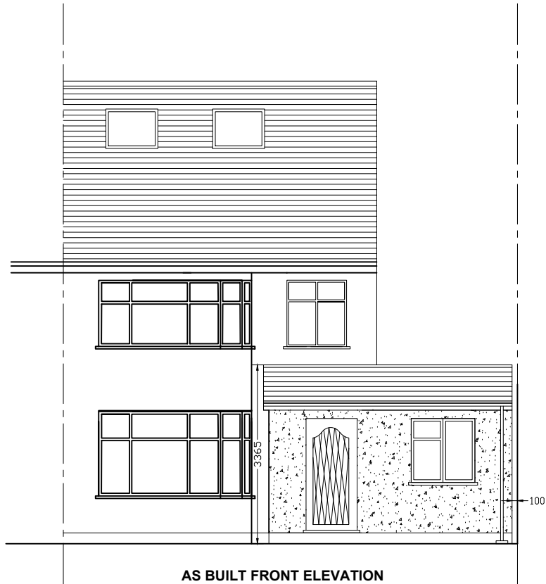
AS BUILT FRONT ELEVATION