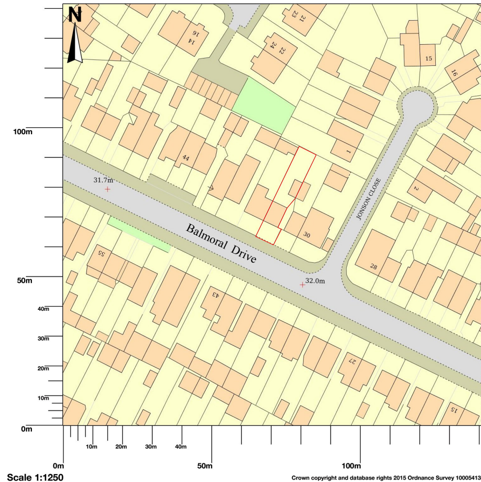
01 A3 LOCATION PLAN SCALE: 1:1250

Map shows area bounded by: 510306.28,181639.3,510447.72,181780.7 (at a scale of 1:1250) The representation of a road, track or path is no evidence of a right of way. The representation of features as lines is no evidence of a property boundary.