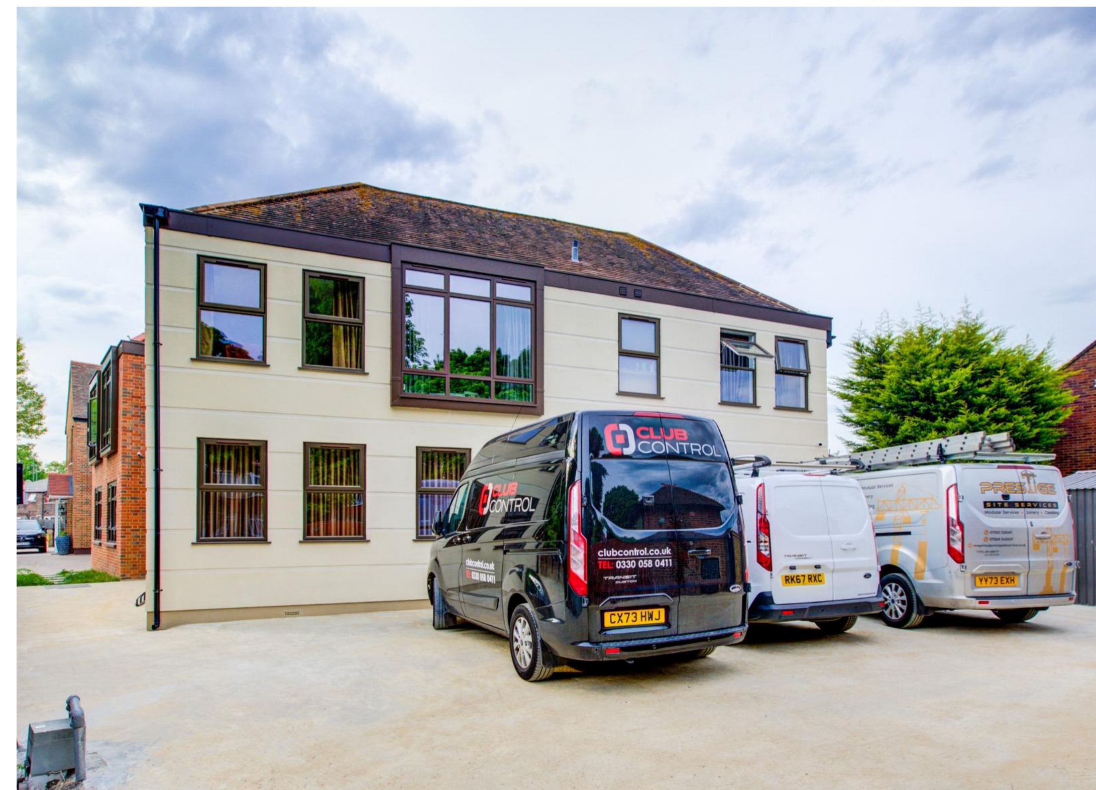
VIEW 4 EXISTING - PHOTO