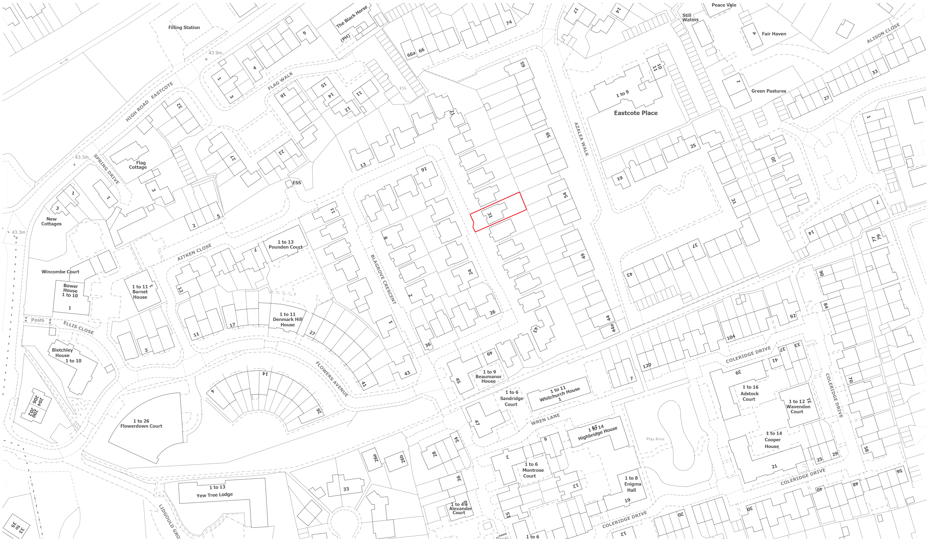
SITE LOCATION PLAN SCALE 1:1250 SITE BOUNDARY :