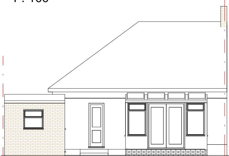
Existing Rear Elevation - East 1 : 100