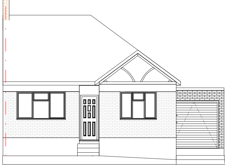
Existing Front Elevation - West 1 : 100