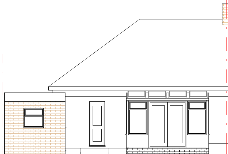
Existing Rear Elevation - East 1 : 100