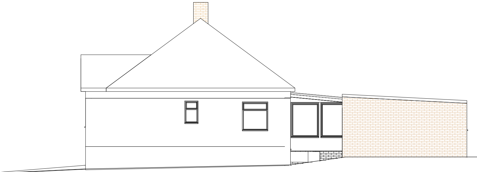
Existing Side Elevation - South 1 : 100