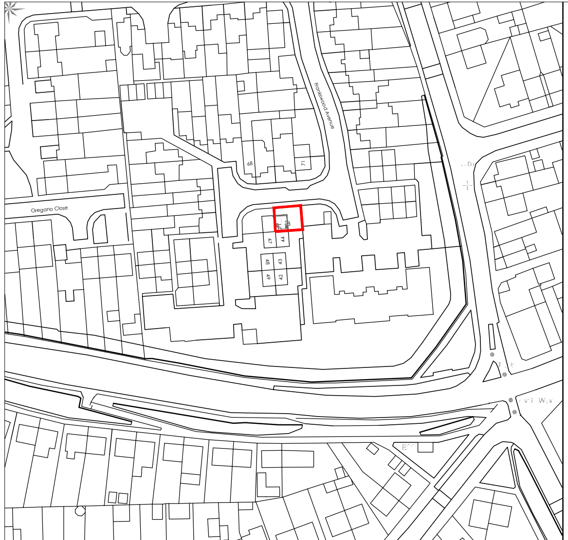
Location Plan (Scale 1:1250)