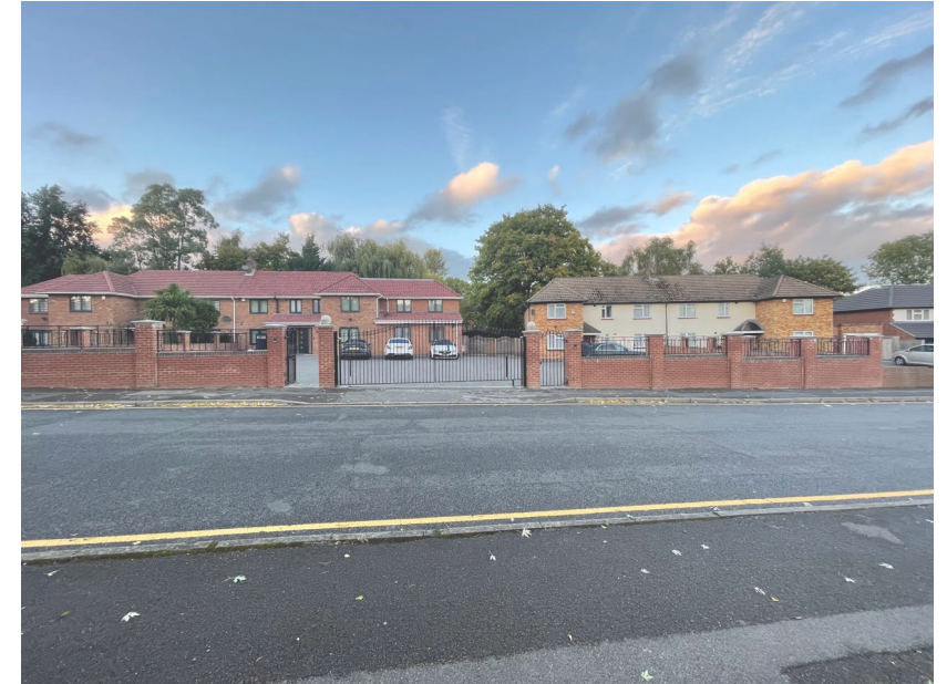
3 Site Photograph - front elevation NTS @ A3