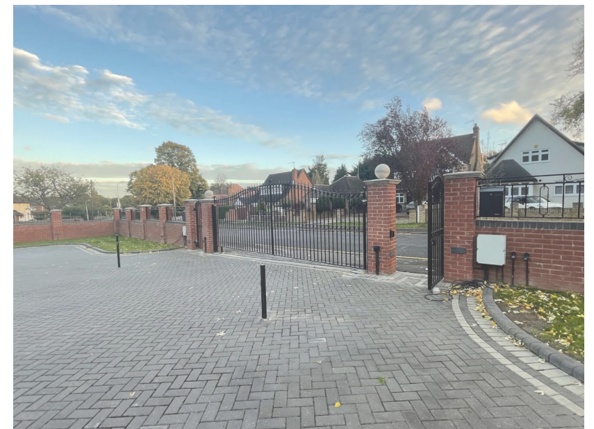
4 Site Photograph - Pedestrian & Vehicular Entrance NTS @ A3

Map area bounded by: 506618,185760 506760,185902. Produced on 10 October 2022 from the OS National Geographic Database. Reproduction in whole or part is prohibited without the prior permission of Ordnance Survey. © Crown copyright 2022. Supplied by UKPlanningMaps.com a licensed OS partner (100054135). Unique plan reference: p2c/uk/860604/1162842