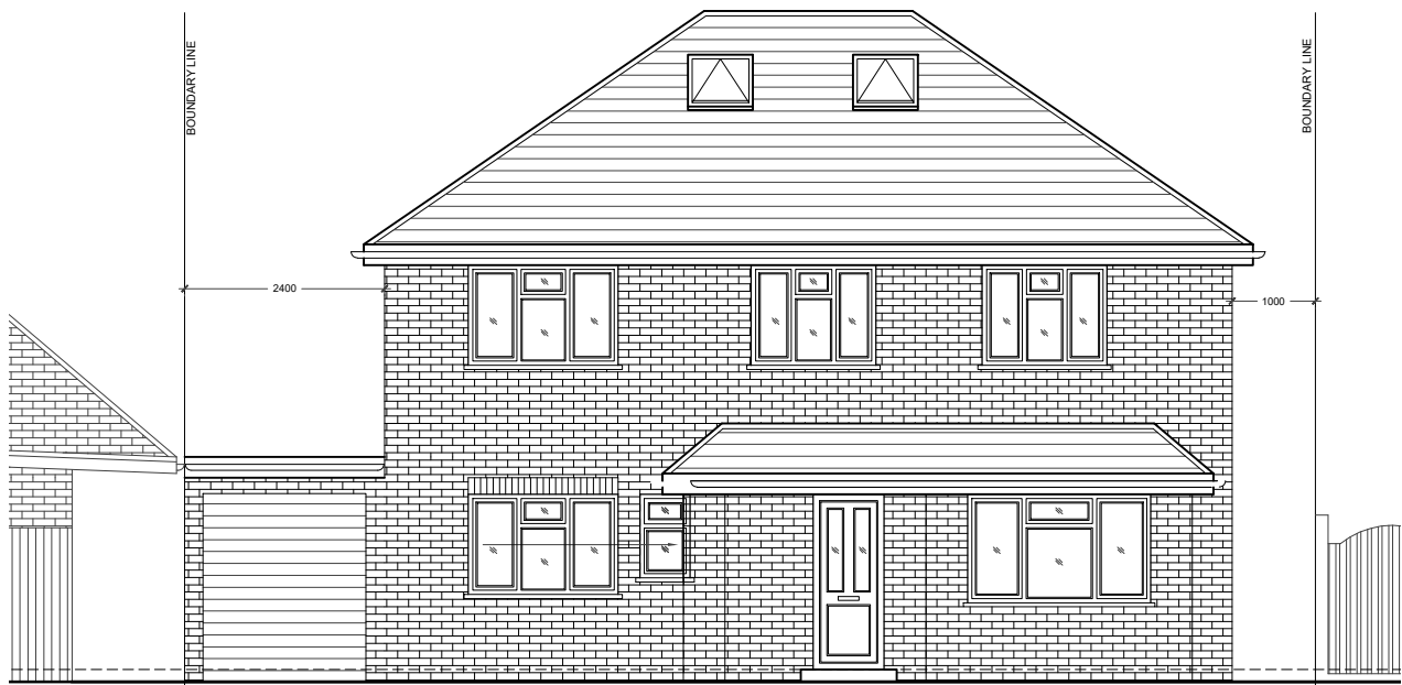
03 - FRONT ELEVATION