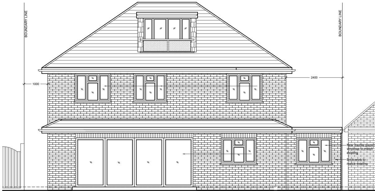
04 - REAR ELEVATION