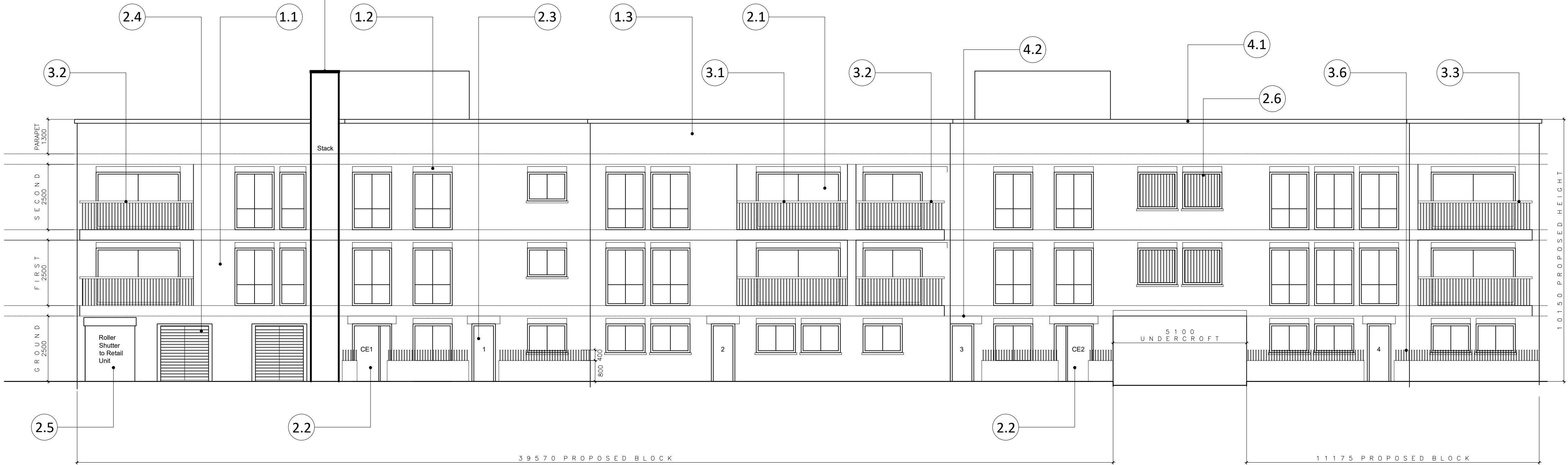
PROPOSED CROWN CLOSE FRONT ELEVATION

Outline of existing Landmark Heritage Asset Chimney Stack fronting Crown Close that is proposed to be retained