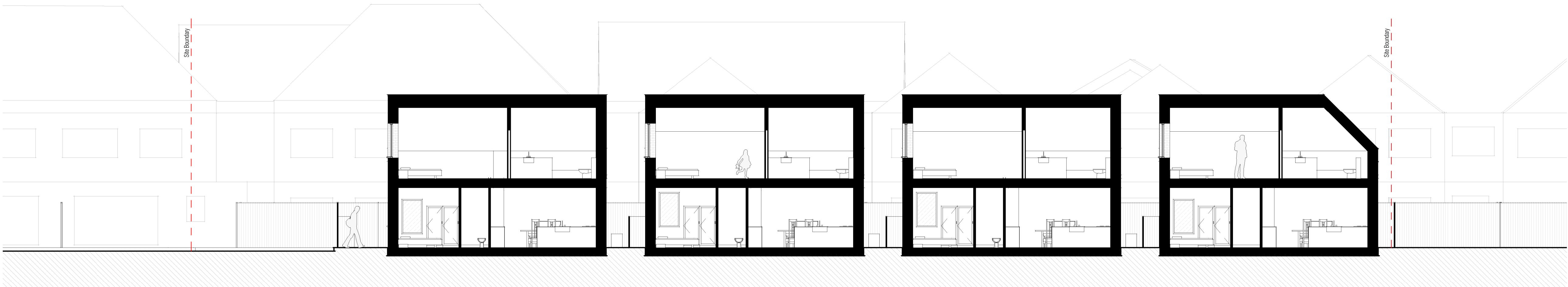
Proposed Section AA