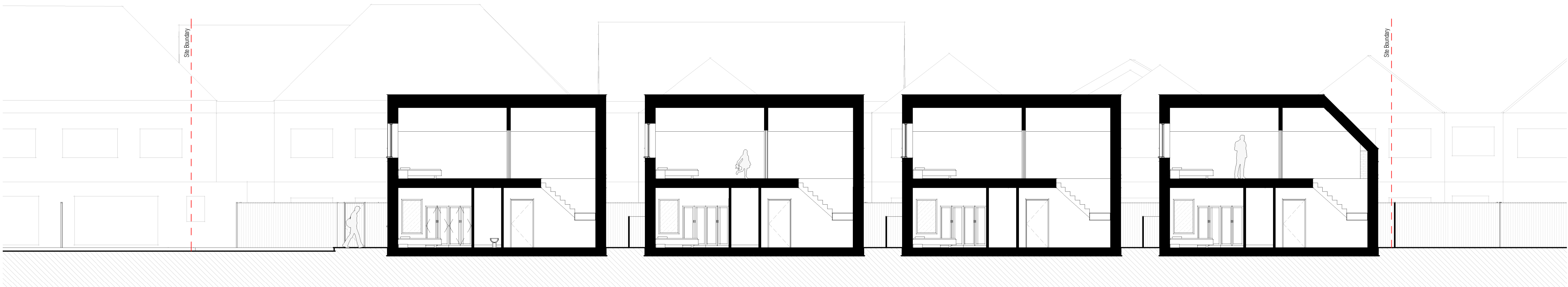
Proposed Section AA

Draft Planning Issue 20/06/23 Updated Unit Locations 22/06/23