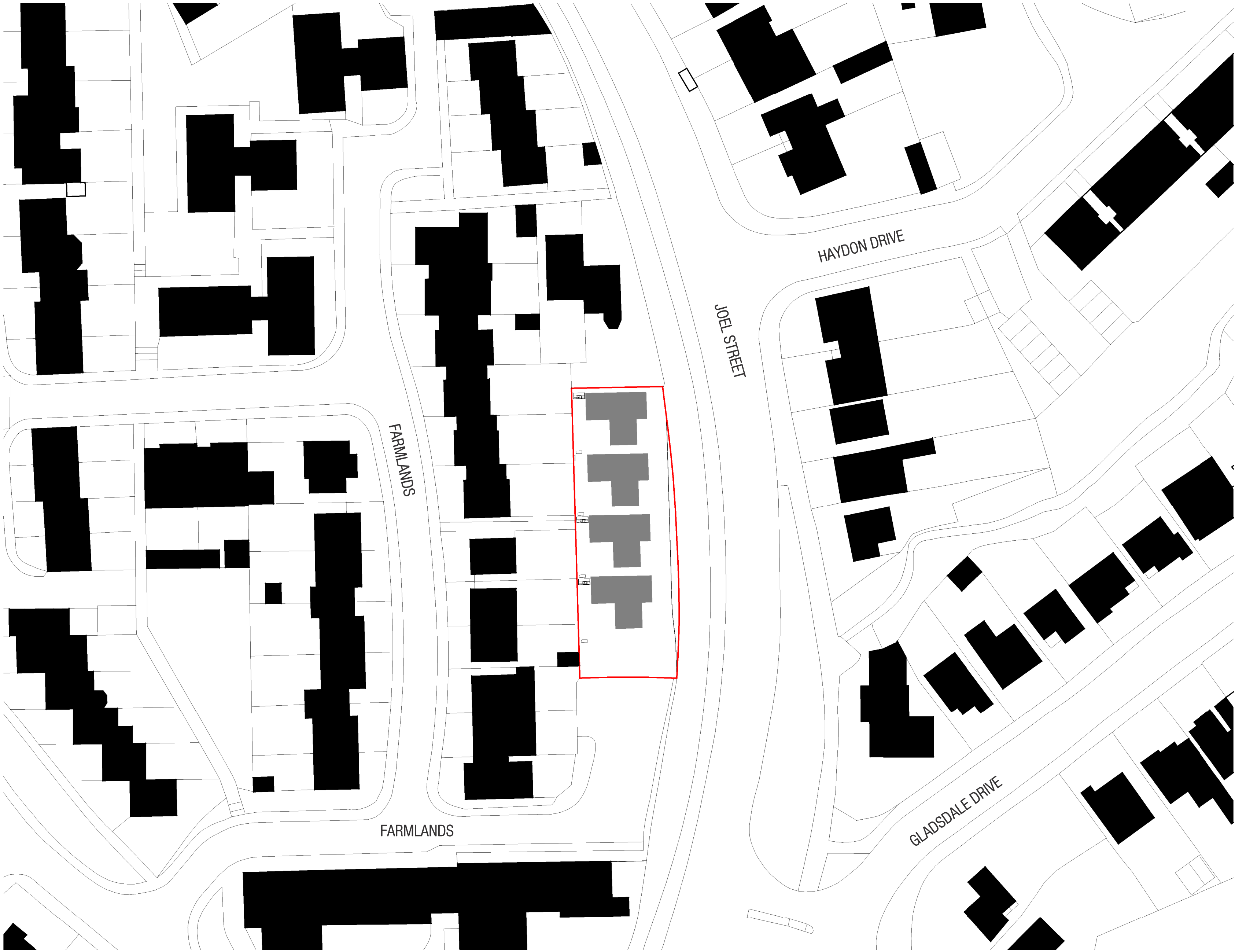
Proposed Block Plan 1 : 500