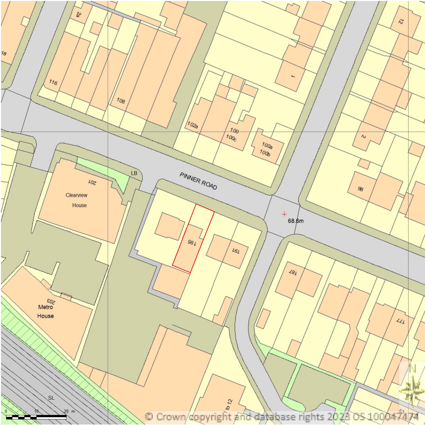
Location Plan @ 1:1250