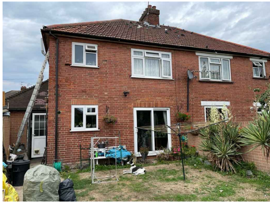
03 - SIDE VIEW