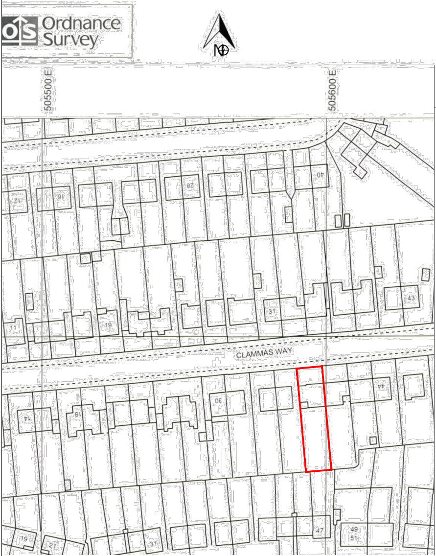
04 - OS MAP SCALE 1:1250