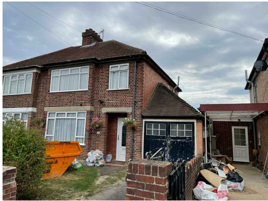
02 - REAR VIEW