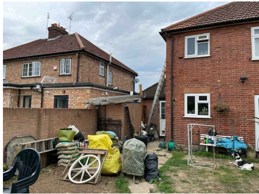
01 - FRONT VIEW