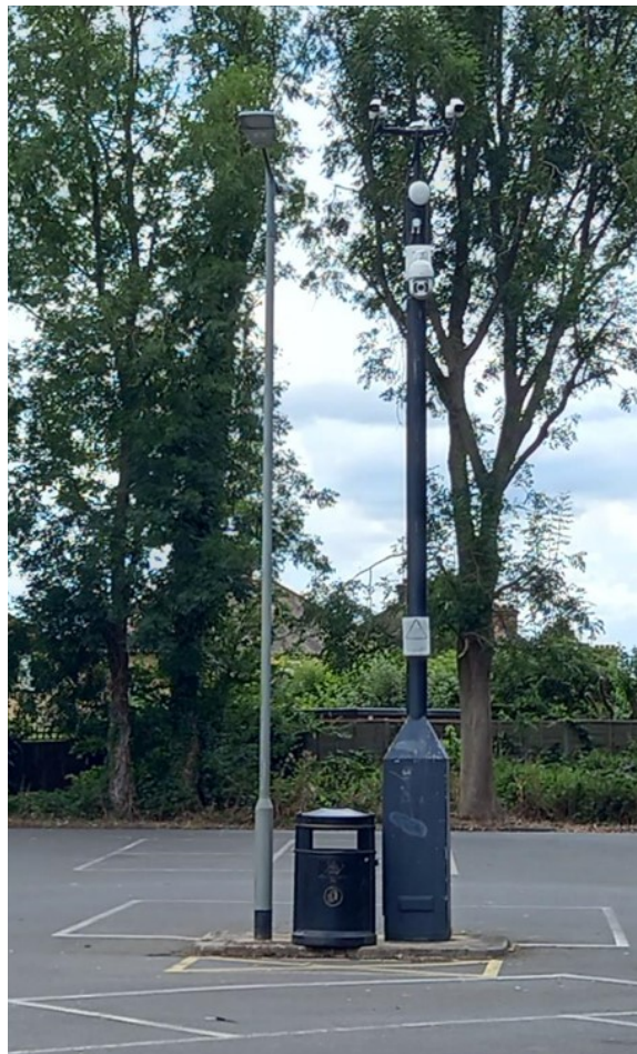
EXISTING FRONT VIEW SHOWING CCTV CAMERA

Refer to drawing No 2022/D/337P/03 REV C FOR LOCATION OF CCTV LAMP POST