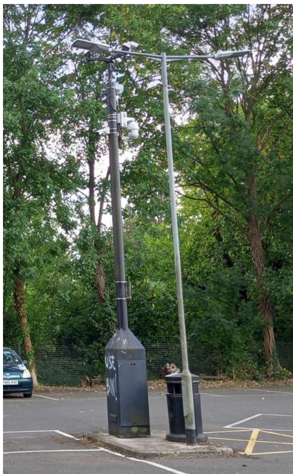
EXISTING SIDE VIEW SHOWING CCTV CAMERA