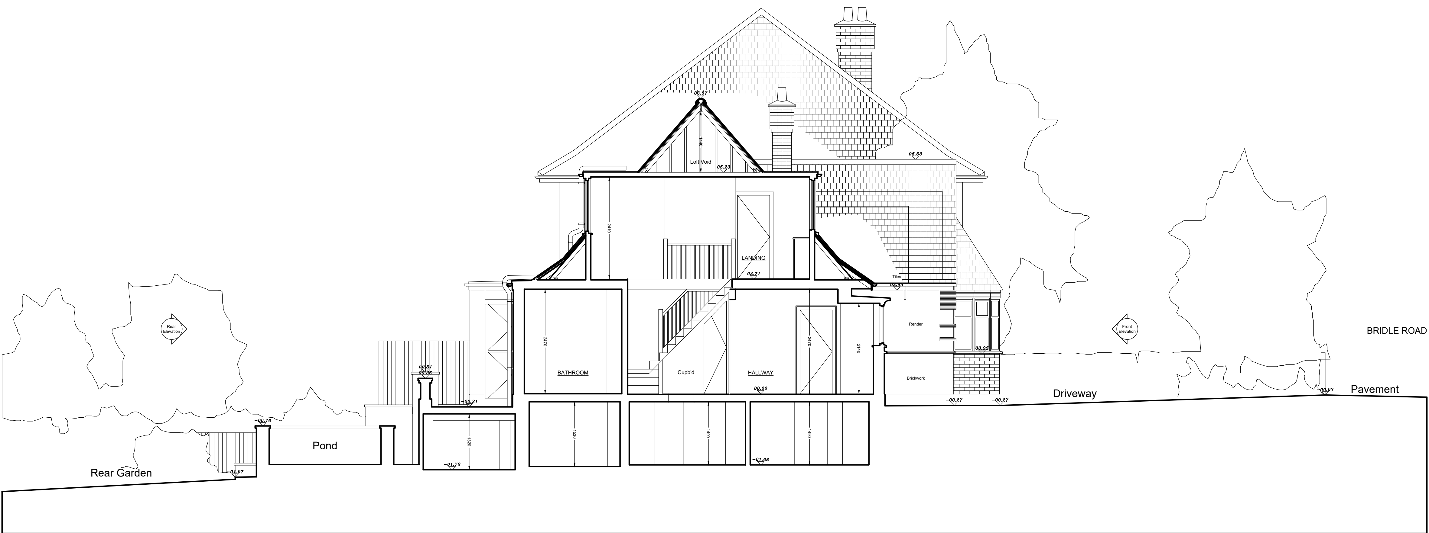
EXISTING CROSS SECTION A - A SCALE - 1 : 50

THE CONTRACTOR IS TO VERIFY ALL BUILDINGS AND SITE DIMENSIONS PRIOR TO COMMENCEMENT OF WORKS OR PREPARATION OF SHOP DRAWINGS. THIS DRAWING AND THE BUILDING WORKS DEPICTED ARE COPYRIGHT OF PT ARCHITECTS AND MAY NOT BE REPRODUCED EXCEPT BY WRITTEN PERMISSION. DO NOT SCALE FROM THIS DRAWING.