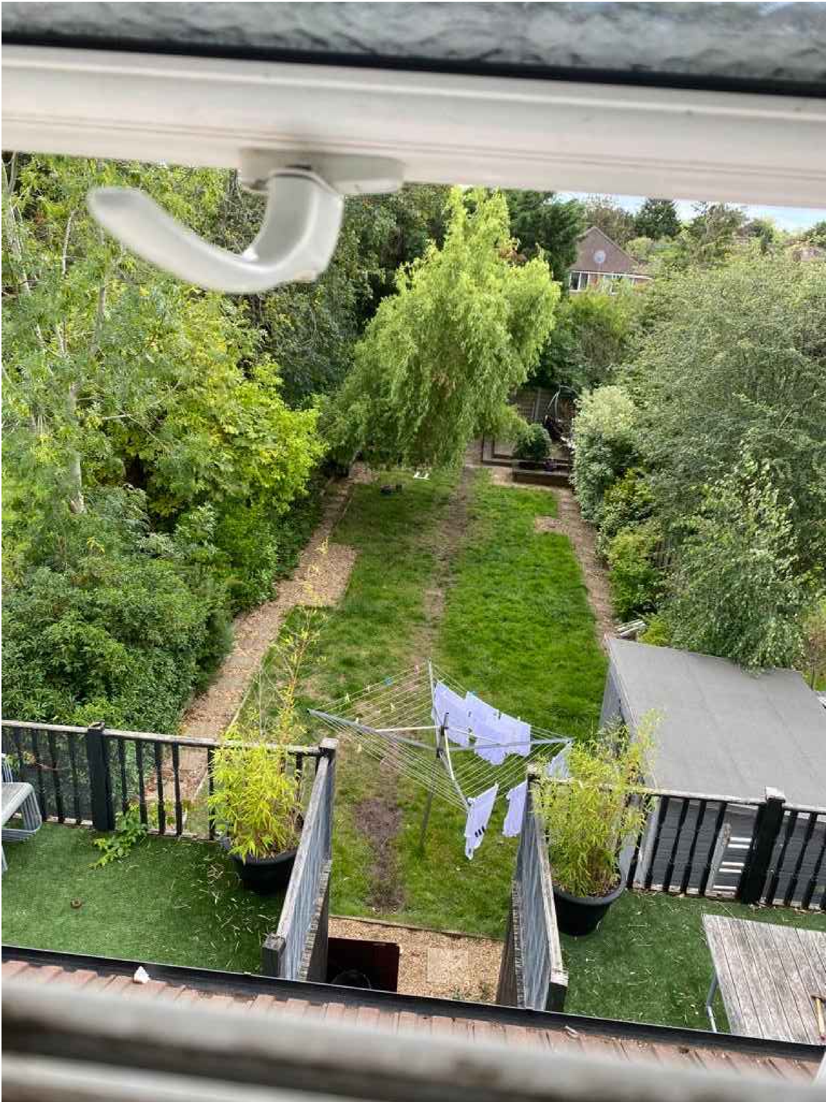
76 BRIDLE ROAD - GARDEN IMAGE FROM HOUSE SITE PHOTOGRAPHS 2 - 76 BRIDLE ROAD SCALE - 1 : 150

THE CONTRACTOR IS TO VERIFY ALL BUILDINGS AND SITE DIMENSIONS PRIOR TO COMMENCEMENT OF WORKS OR PREPARATION OF SHOP DRAWINGS. THIS DRAWING AND THE BUILDING WORKS DEPICTED ARE COPYRIGHT OF PT ARCHITECTS AND MAY NOT BE REPRODUCED EXCEPT BY WRITTEN PERMISSION. DO NOT SCALE FROM THIS DRAWING.