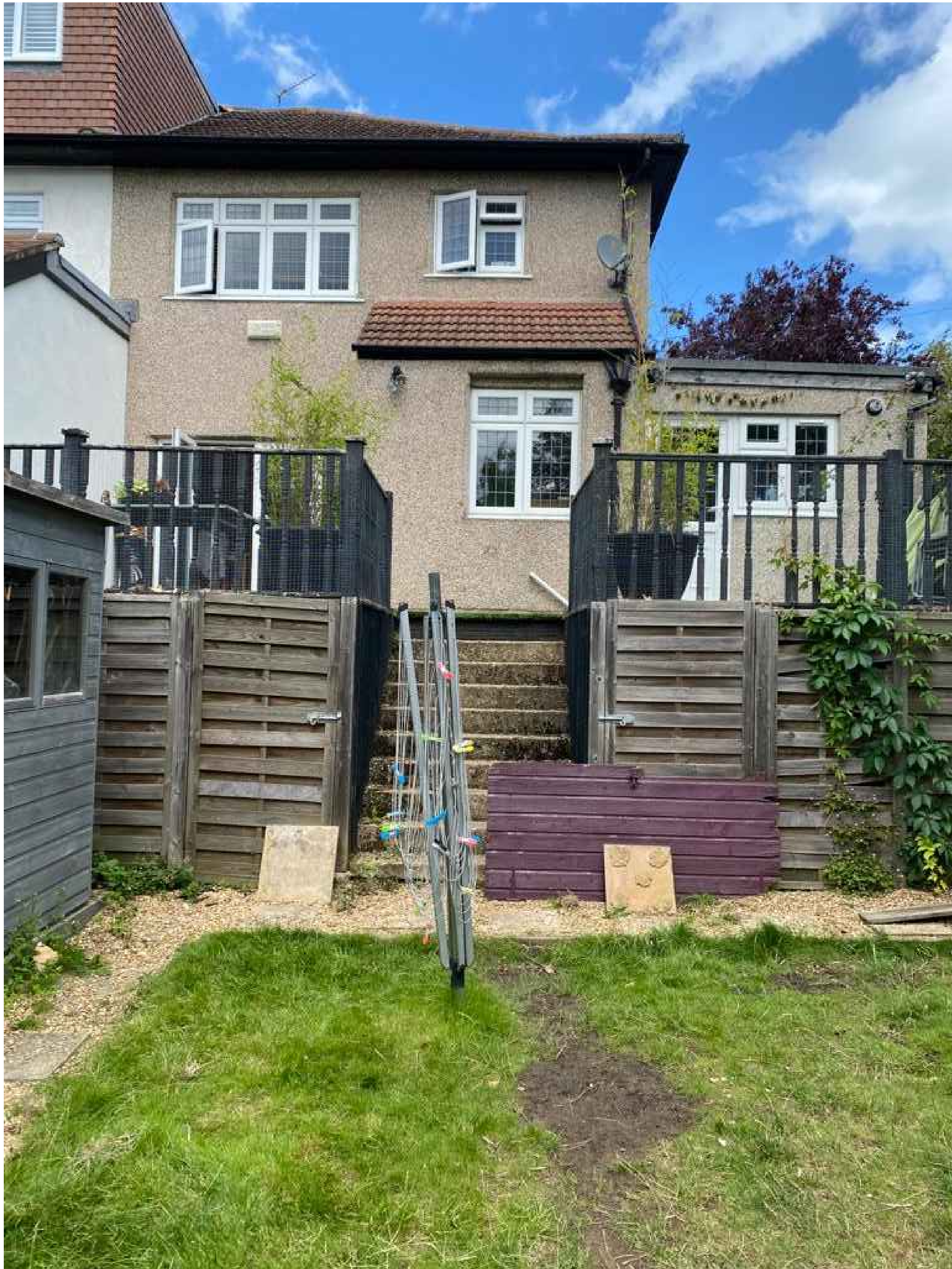
76 BRIDLE ROAD - REAR ELEVATION SITE PHOTOGRAPHS 1 - 76 BRIDLE ROAD SCALE - 1 : 150