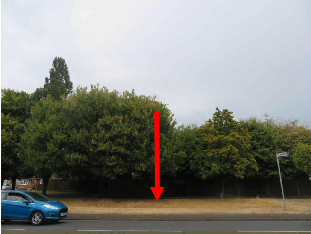
Figure 1 - Site Photograph's

Proposed location of a new mast shown above will assimilate well into the immediate street scene and not be detrimental.