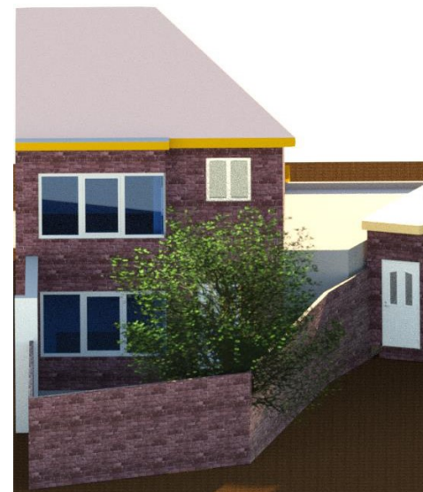
4 3D Rear View 1 : 1