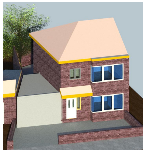
3 3D Front View 1 : 1