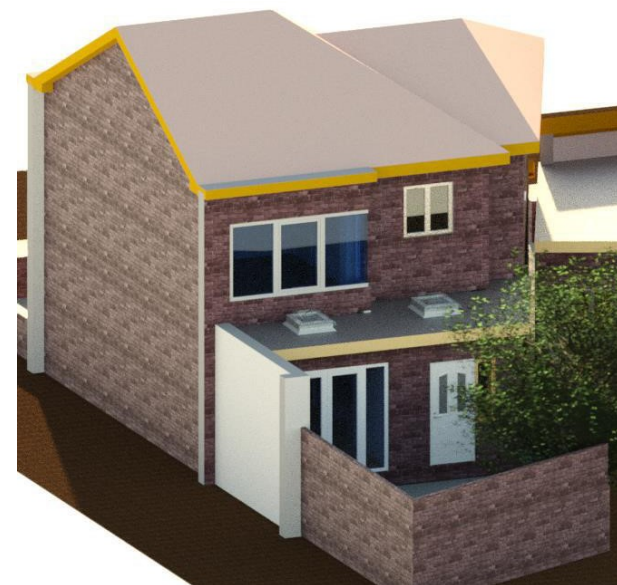
4 3D Rear View 1 : 1