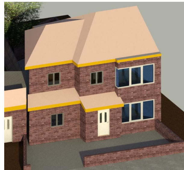
3 3D Front View 1 : 1