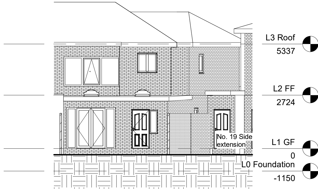
1 Rear View 1 : 100