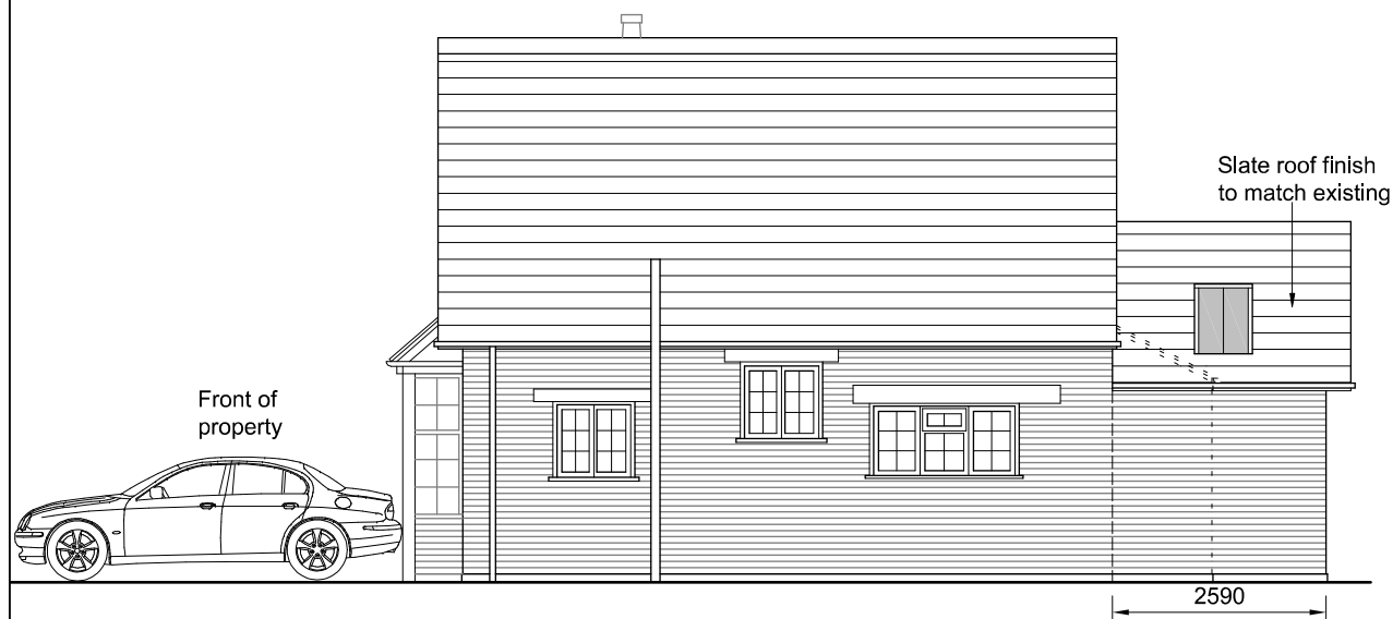
Side Elevation (East) as Existing