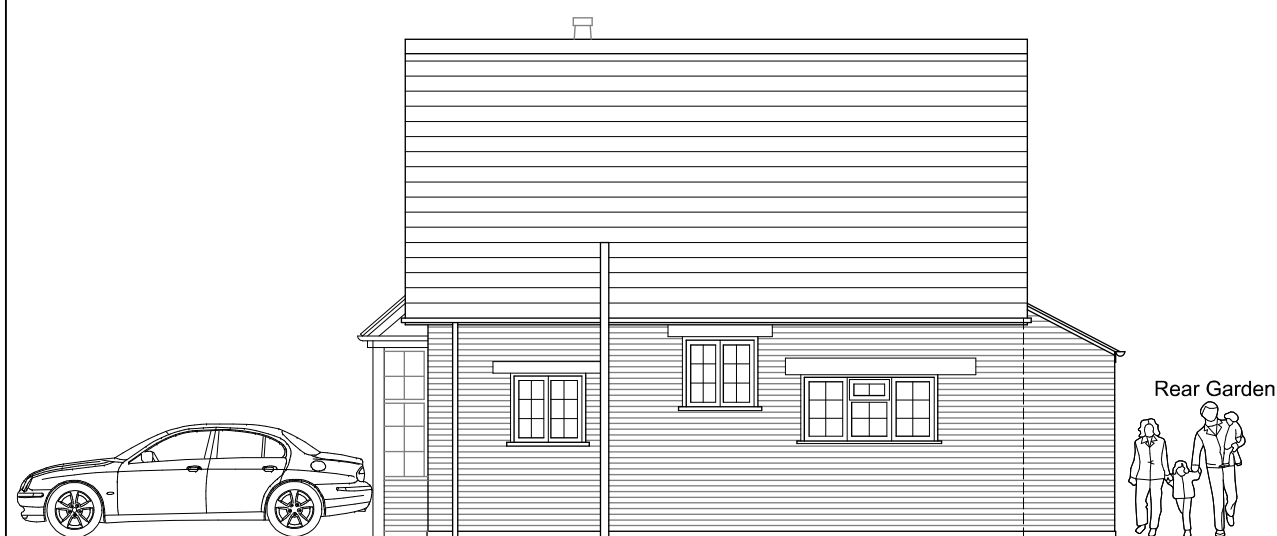
Side Elevation (East) as Existing