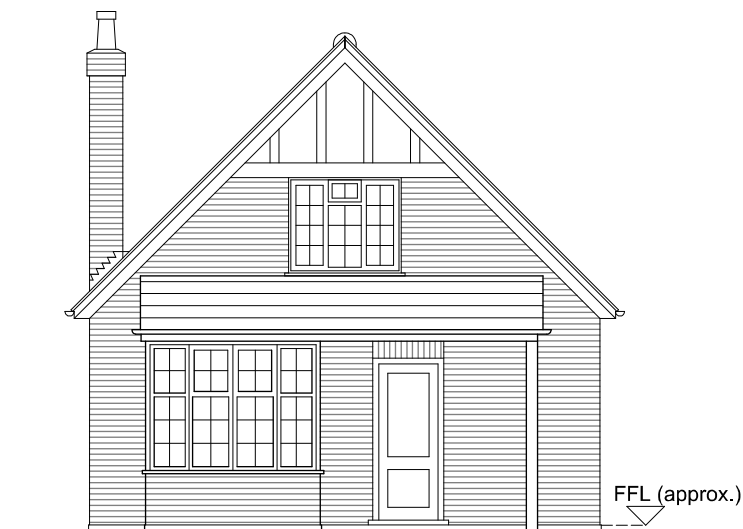
Front Elevation (South) as Existing