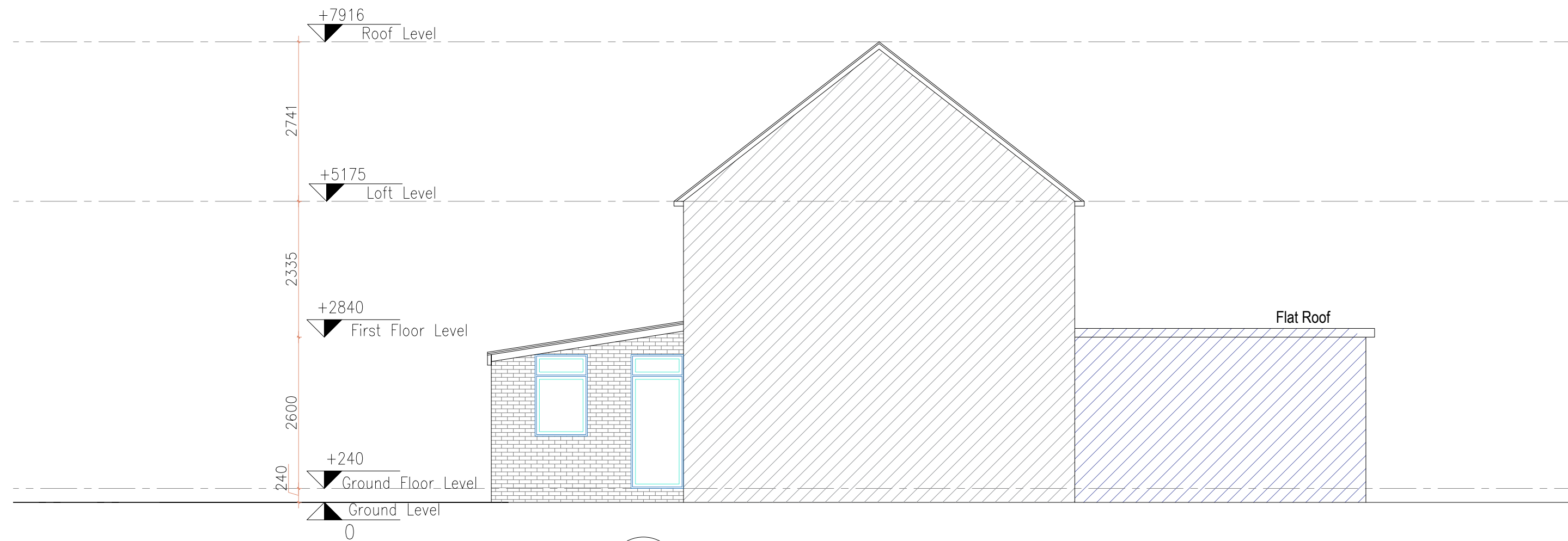
17 PROPOSED SIDE ELEVATION SCALE 1:100 @ A3