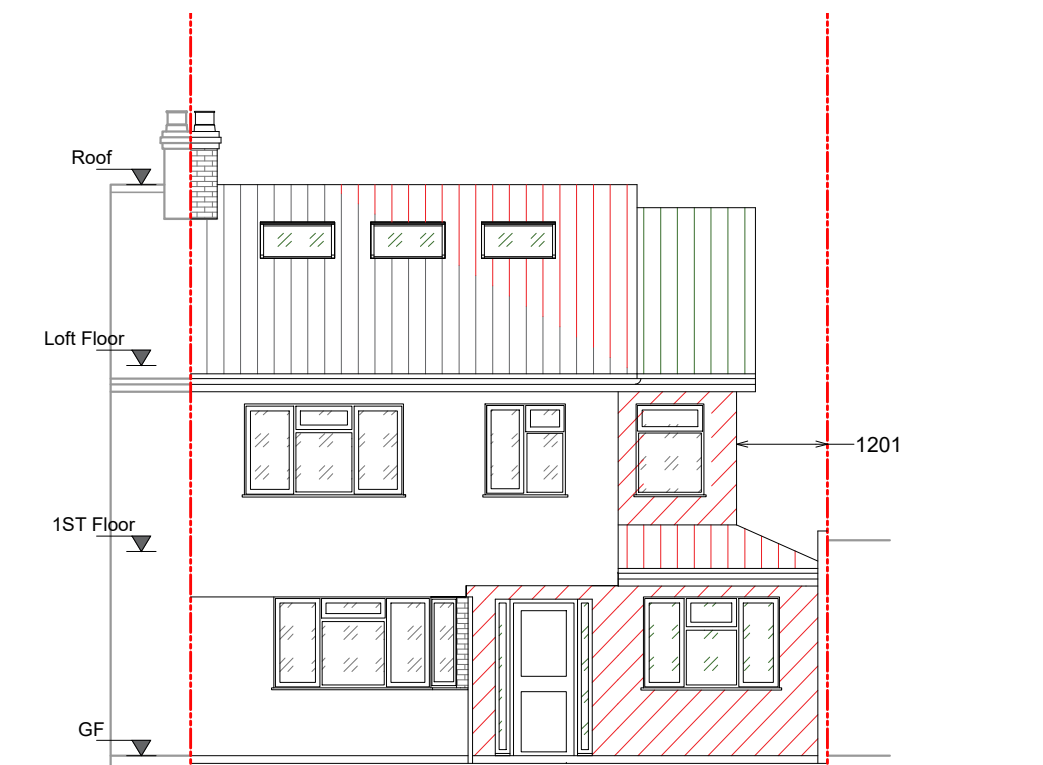
PROPOSED FRONT ELEVATION Combine with both approved scale 1:100