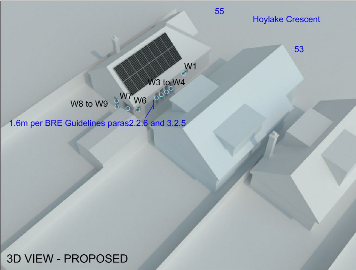
3D VIEW - PROPOSED