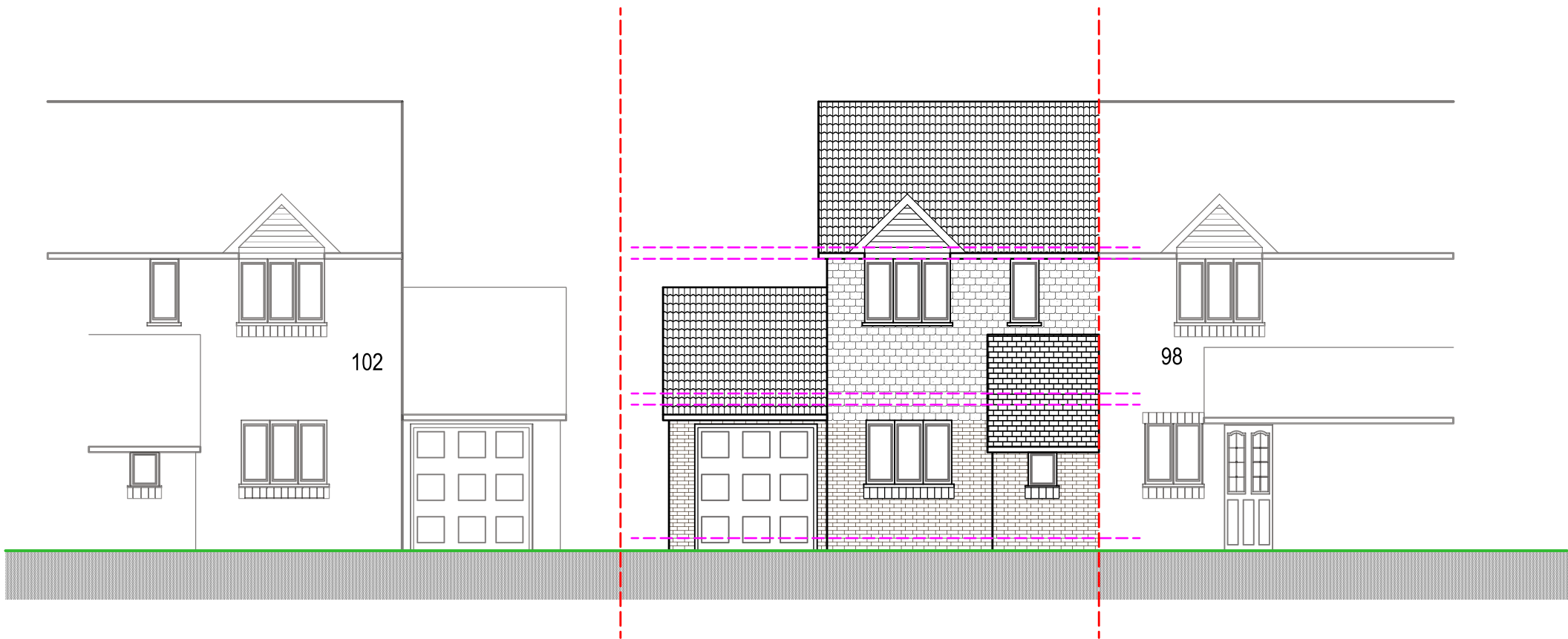
PROPOSED FRONT ELEVATION (no change)