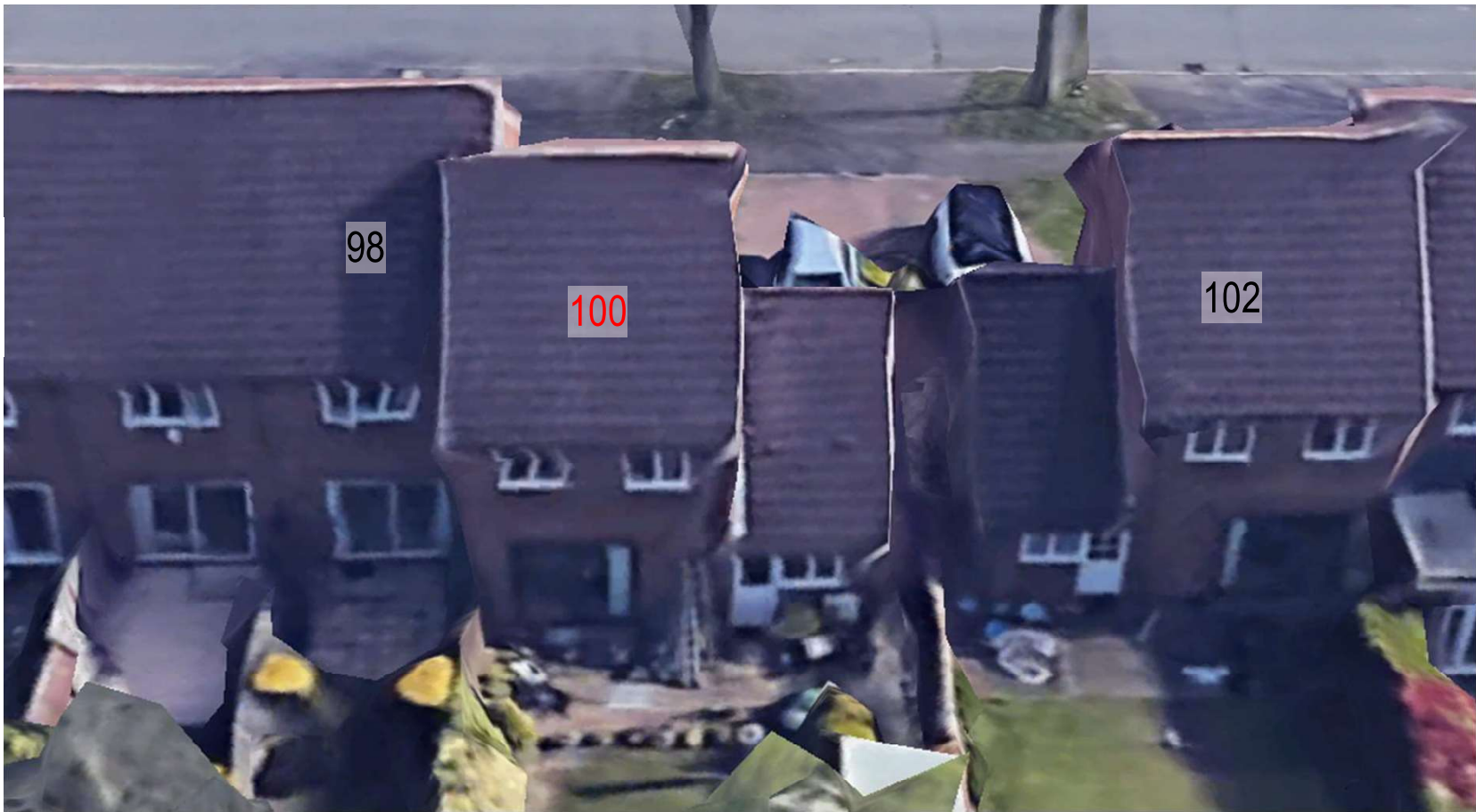
AERIAL VIEW site shown in red