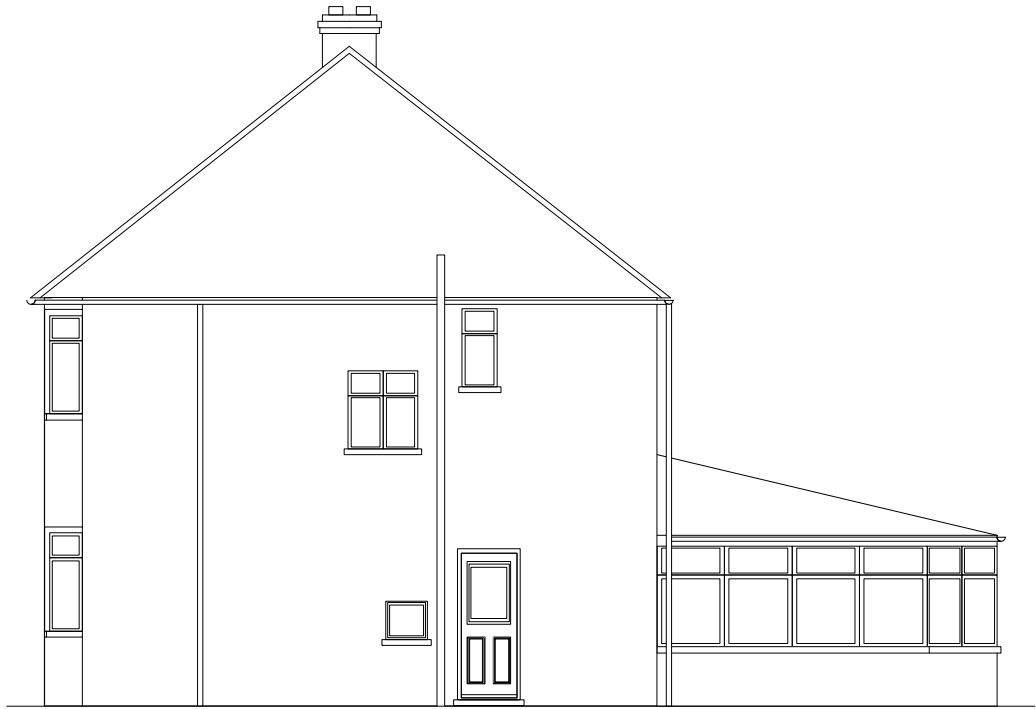
901 EXISTING SIDE ELEVATION -