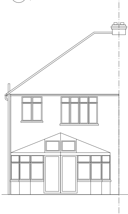
901 EXISTING REAR ELEVATION -