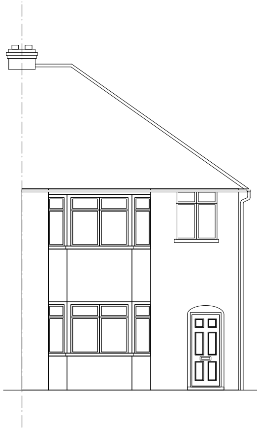
901 EXISTING FRONT ELEVATION -