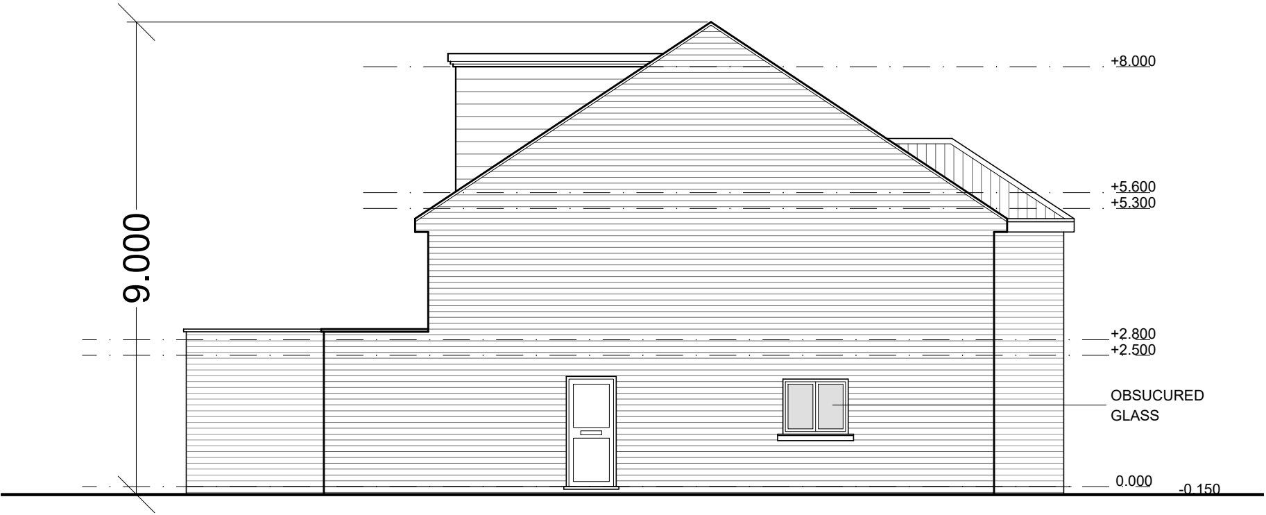
PROPOSED LEFT ELEVATION