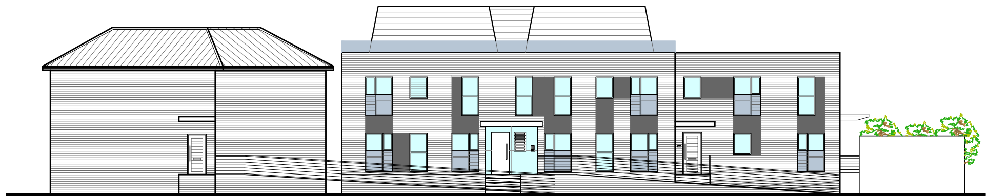
PROPOSED ELEVATION FROM ACCESS ROAD

REVISION NOTE: A - 31.03.2023: BUILDING REDUCED IN HEIGHT BY 1.275m. B - 03.10.2023: PROPOSED ELEVATION FROM YEADING BROOK AMENDED.