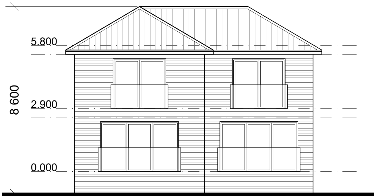
PROPOSED REAR ELEVATION BUILDING 2