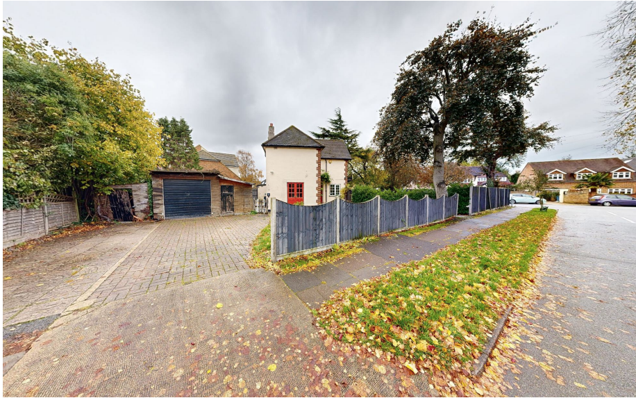
1 - Street view