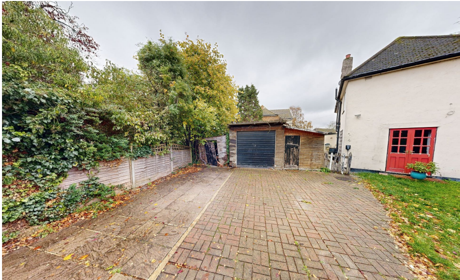
3 - Garage view