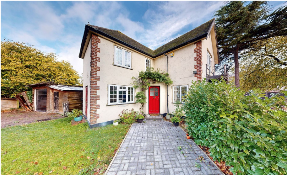
4 - External house view