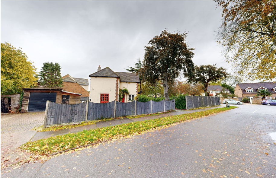
7 - Street view