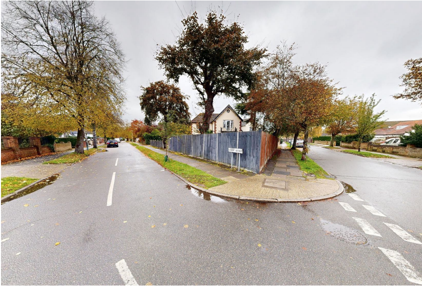
2 - View from Sunray and Lawn Avenue