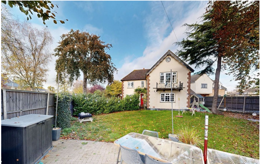
5 - Side garden