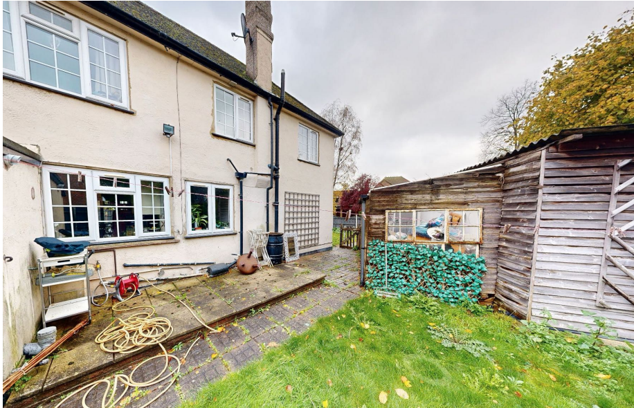
6 - Rear house