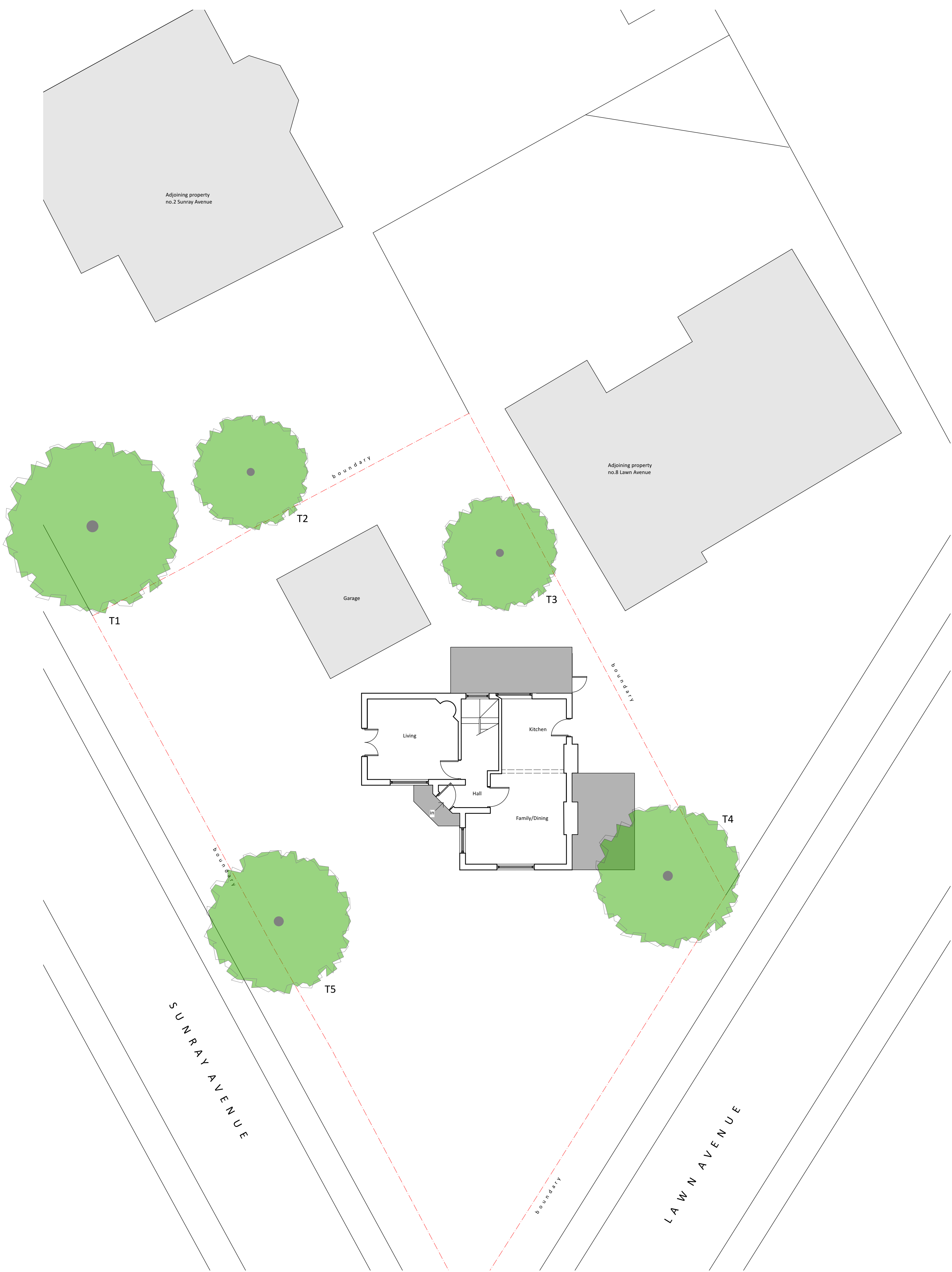
1 GROUND Scale: 1:100