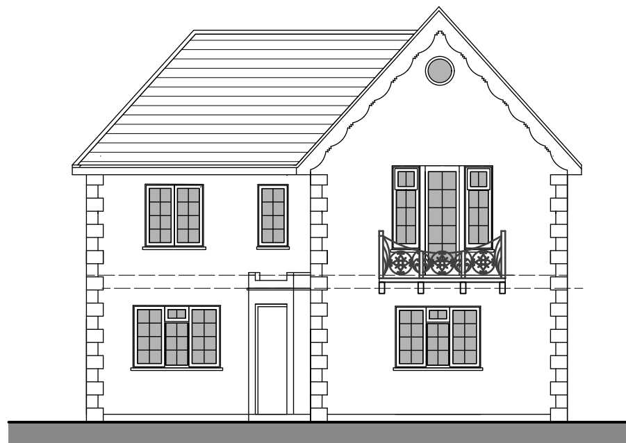
2 SOUTH Scale: 1:100