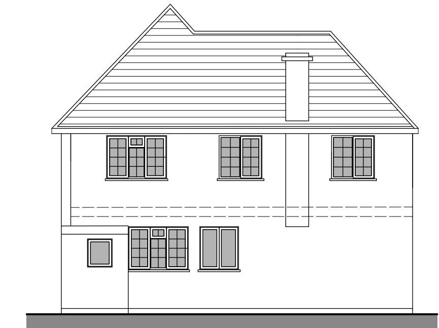
4 NORTH Scale: 1:100