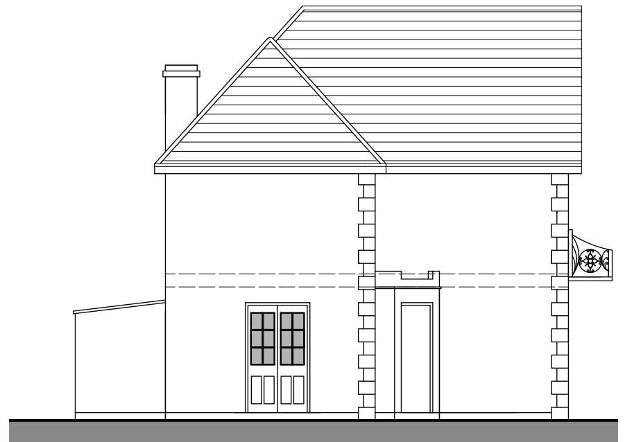
3 WEST Scale: 1:100