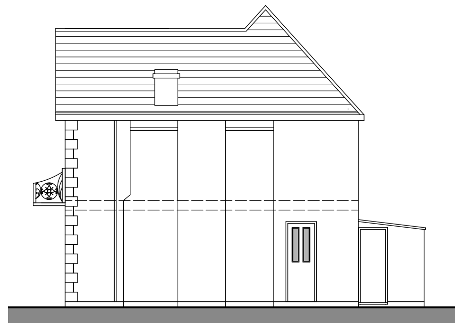
5 EAST Scale: 1:100