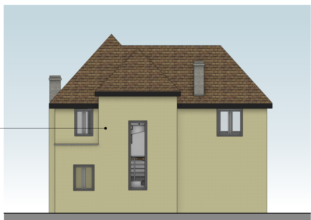
4 NORTH Scale: 1:100