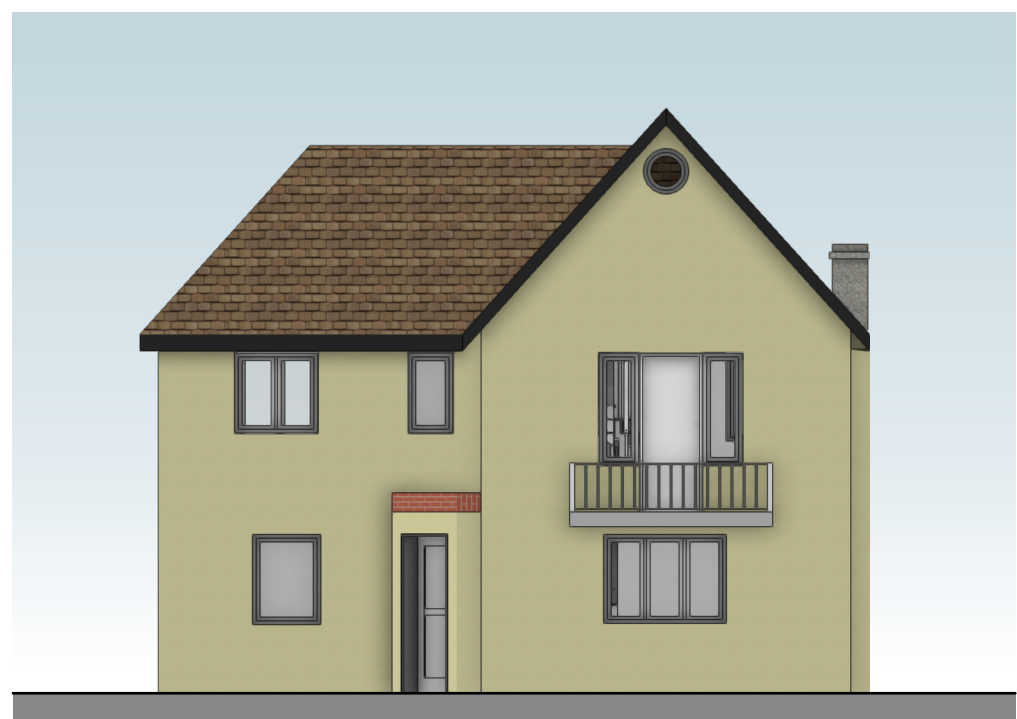
5 SOUTH Scale: 1:100