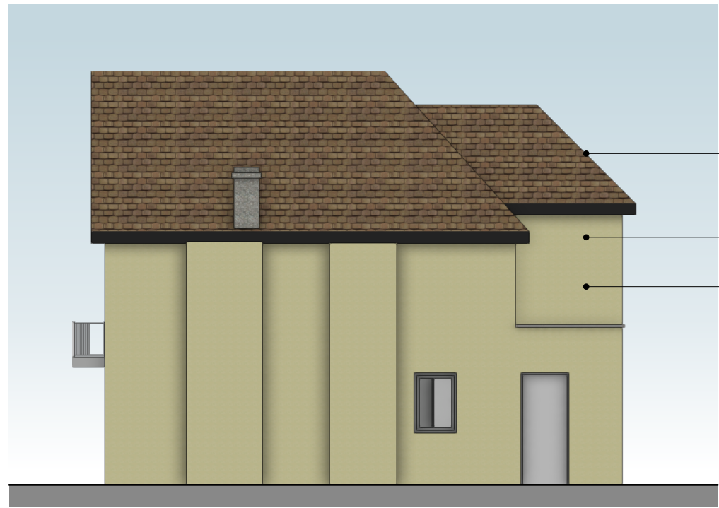
2 EAST Scale: 1:100