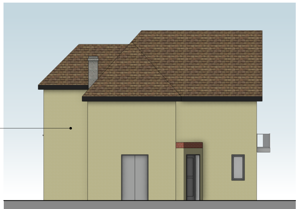
3 WEST Scale: 1:100