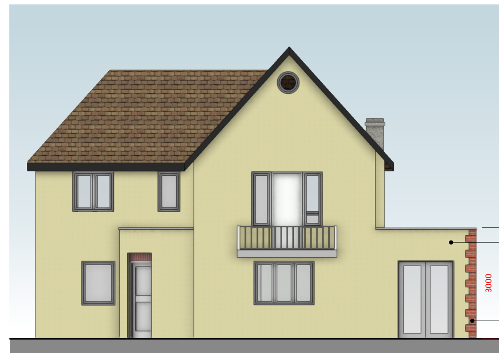
2 SOUTH Scale: 1:100