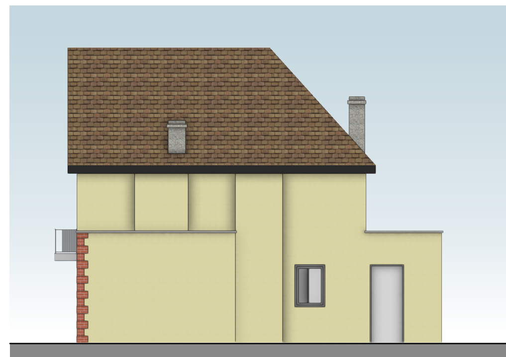
3 EAST Scale: 1:100