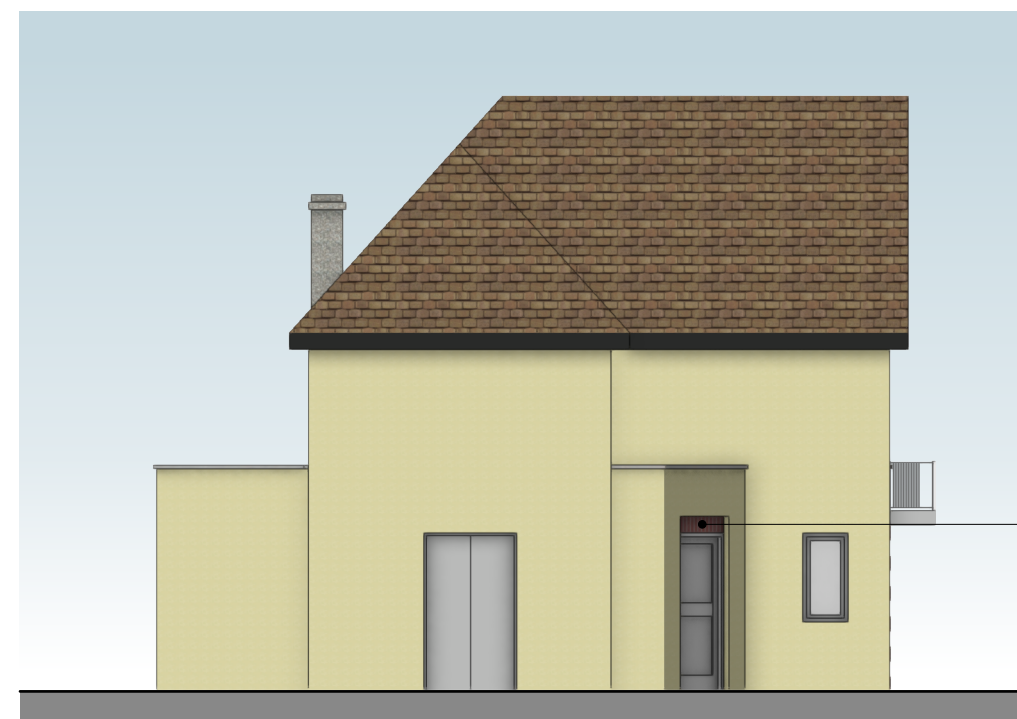
4 WEST Scale: 1:100