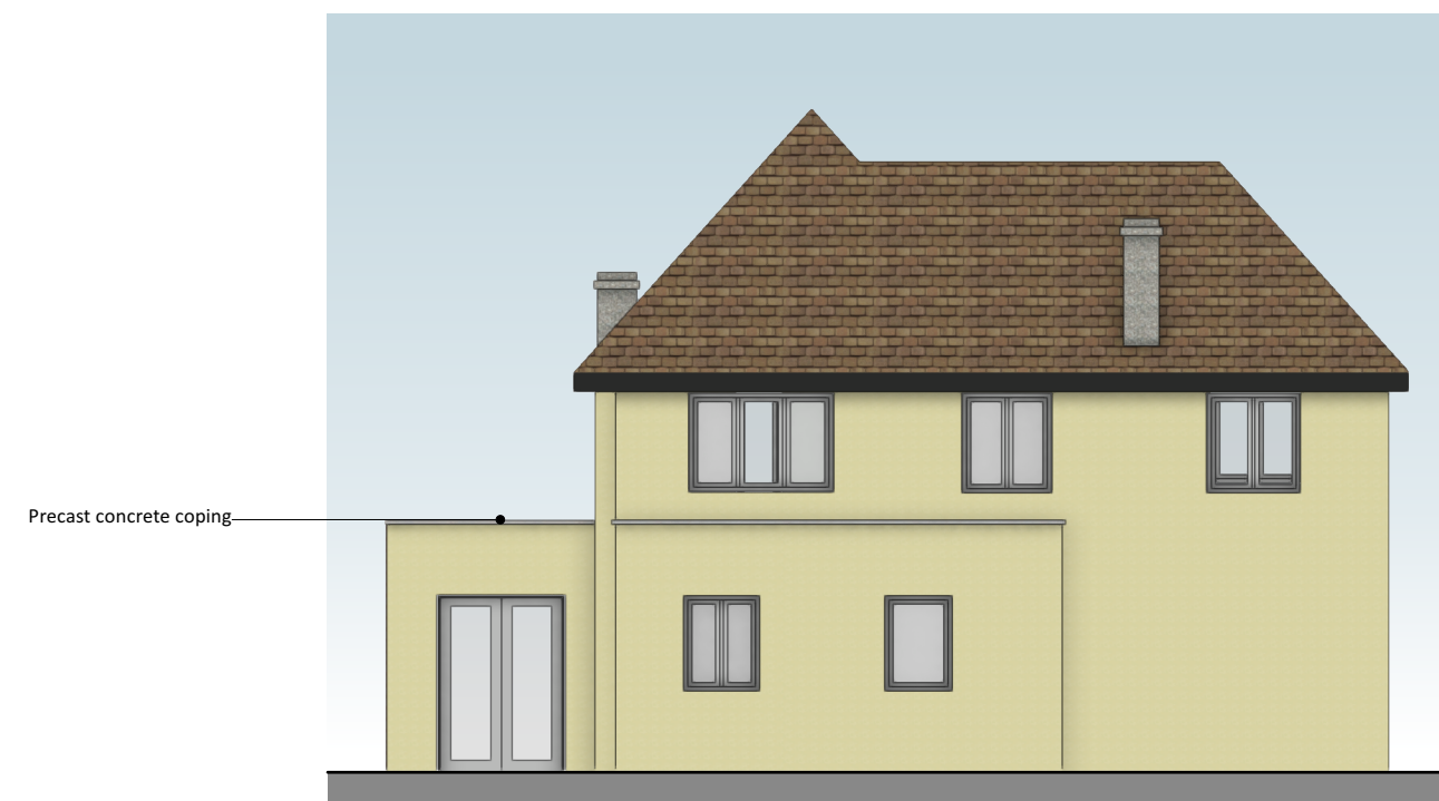
5 NORTH Scale: 1:100