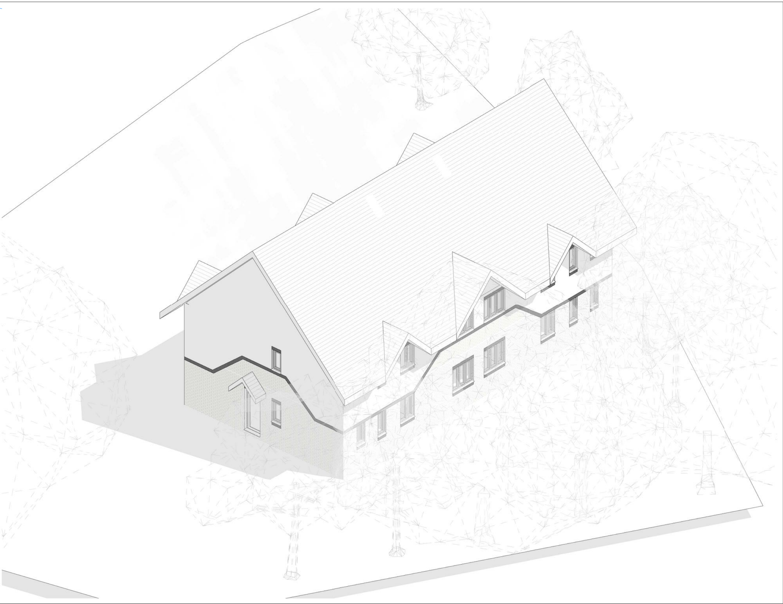
Existing North East