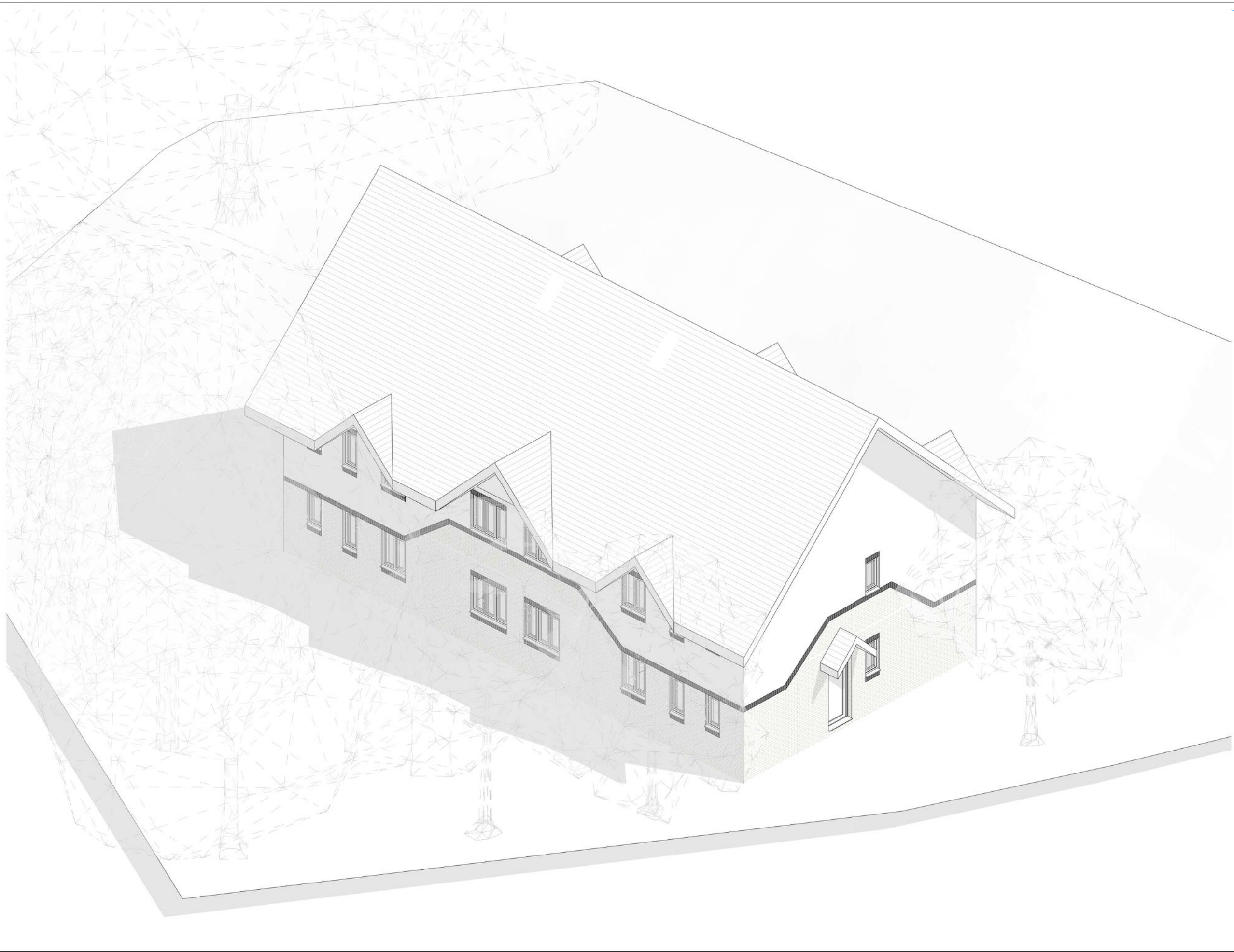
Existing North West