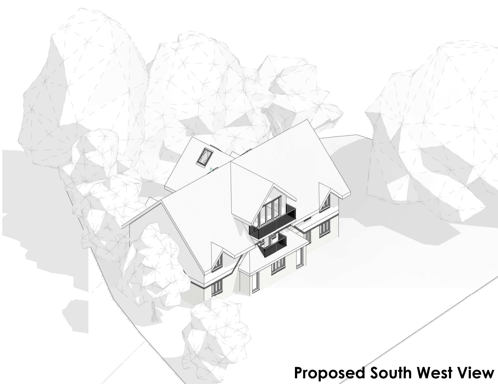
Proposed South West View