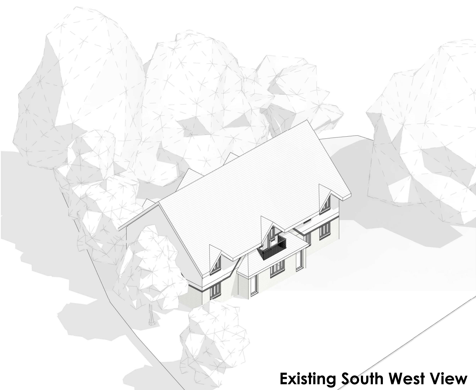
Existing South West View