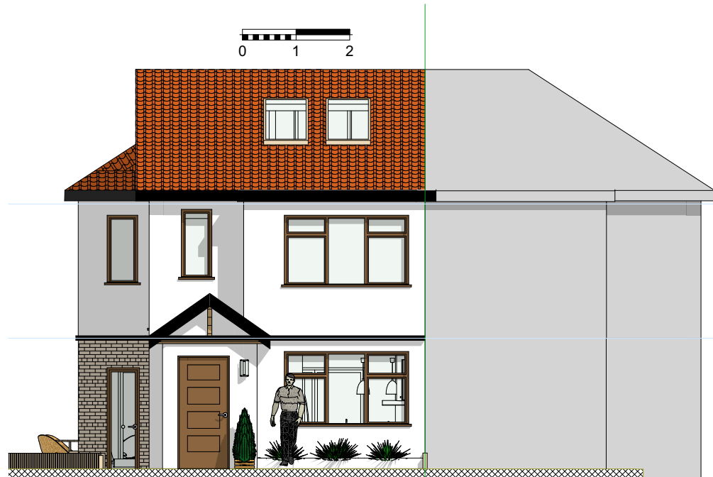
FRONT WEST ELEVATION