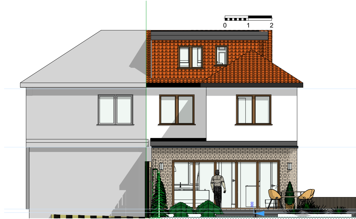
EAST REAR ELEVATION